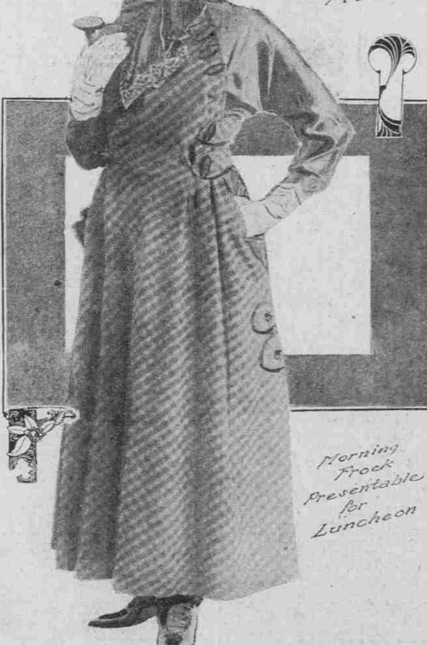
Morning Frock Presentable for Luncheon