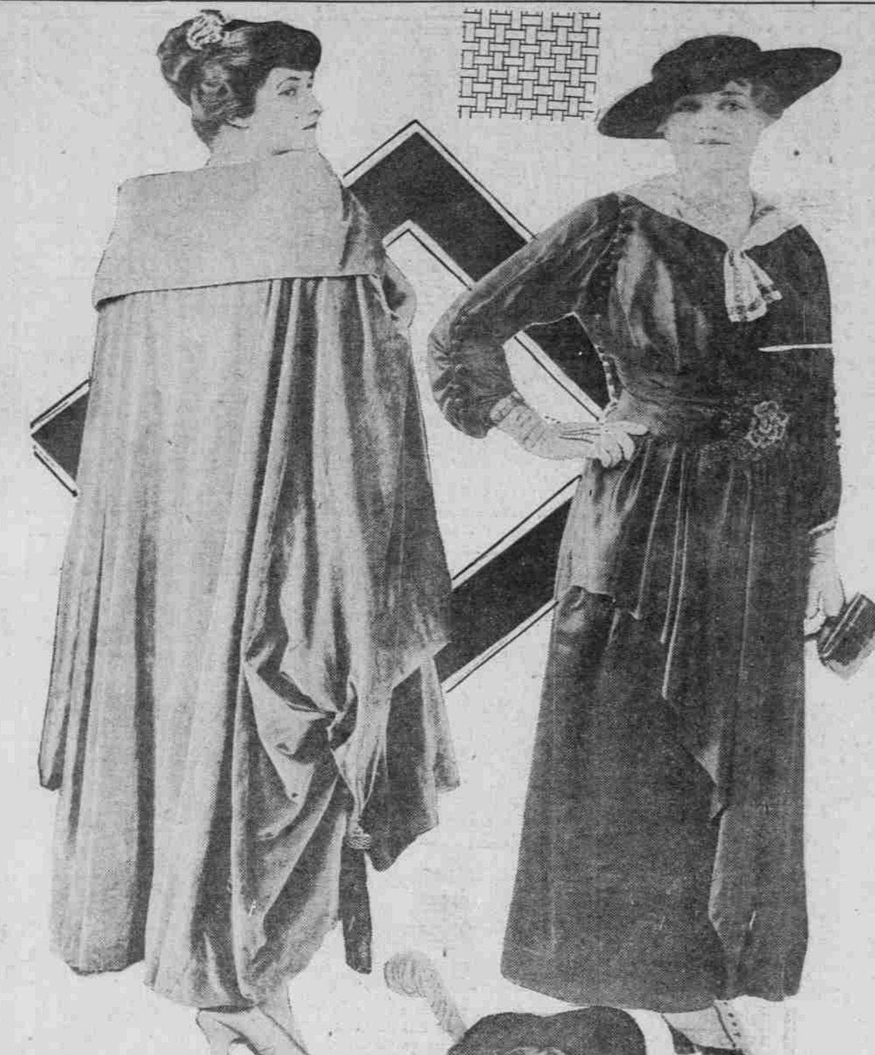
Voluminous Wrap of the Moment.

Latest Piece of Apparel Is Really Huge Inverted Bag, Slashed Across Top for Neck Opening, With Two Corners Falling at Sides and Weighted With Large, Enormous Chenille Tassels.