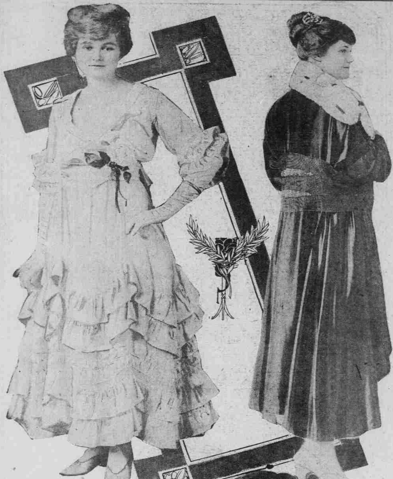
For Supper and Dance is This Dainty Debutante Frock.

Like Bonny Highlander, Maid Wears Scarf Plaited Over Shoulder With Soft, Airy Tulle Supplanting Folded Plaid—Stunning Coat of Black Goldenrod Satin Is Suitable for Taxi and Restaurant Wear.