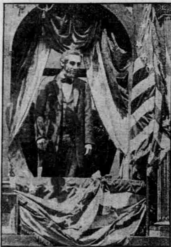
Abraham Lincoln at Ford's Theater.

5000 Scenes, 18,000 People, 3000 Horses. Cost $500,000. Eight Months in the Making. Eighth Wonder of the World.