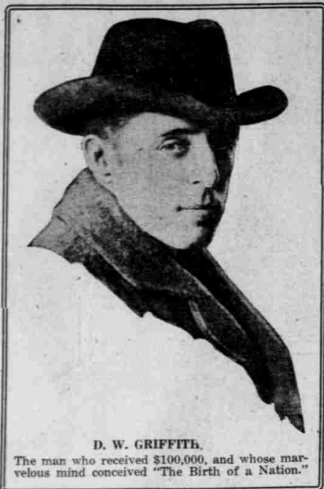
D. W. GRIFFITH. The man who received $100,000, and whose marvelous mind conceived "The Birth of a Nation."