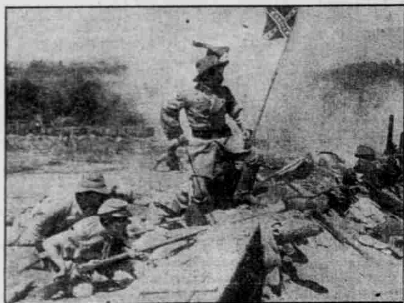
Fighting for the South.

Most Tremendous Dramatic Spectacle That the Brain of Man Has Yet Produced