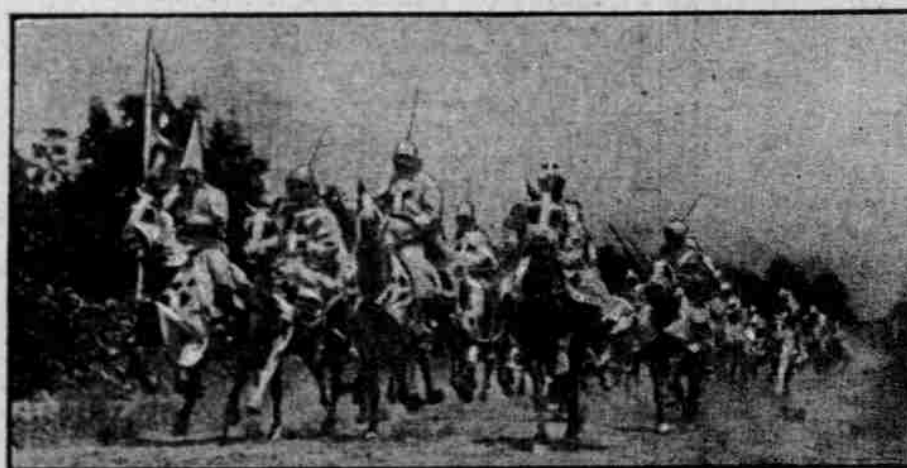
Gathering of the Ku Klux Klan.