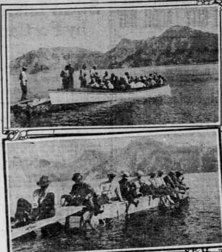
Top—First Boatload to Leave for Wizard Island. Below—Bathing Feet After Returning From Crater, Where Ceremony Was Held.