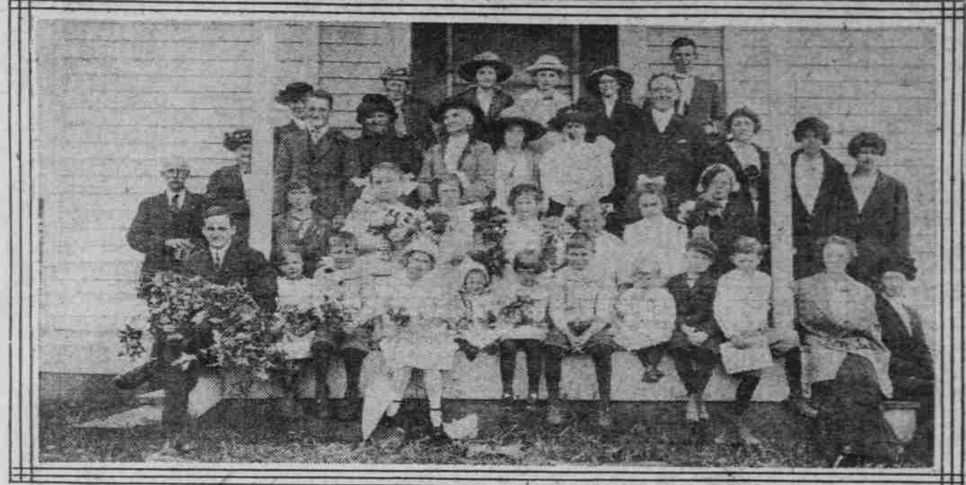
Clatsop Plains Presbyterian Church Members.

Presbyterian Institution at Clatsop Plains Is Oldest One West of Rocky-Mountain Range and Pioneer of Religious Work Among Early Settlers of Northwest Country.