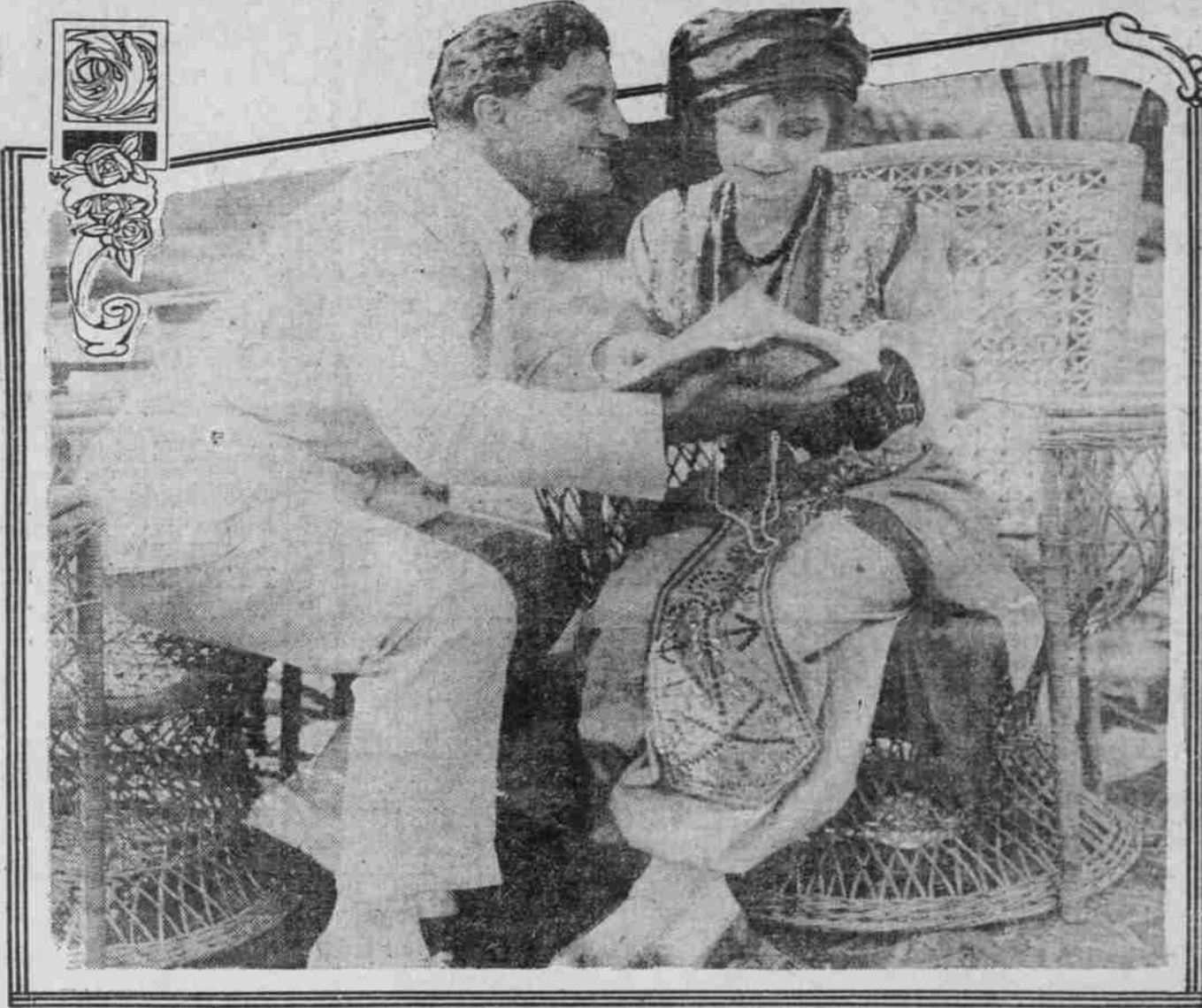
Francis Bushman and Ruth Stonehouse in "The Slim Princess" At The Orpheum

Fifth National Convention Draws Stars and Producers From Many Points of Country to San Francisco—Meeting Most Successful One Ever Held by Moving Picture Folk and Features Are Numerous.