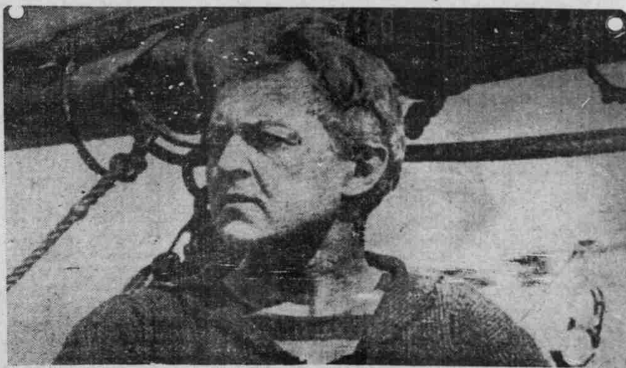
Scene From "Sea Wolf"