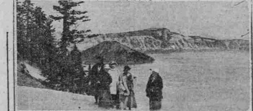
First Party To Reach Crater Lake From Medford In 1915