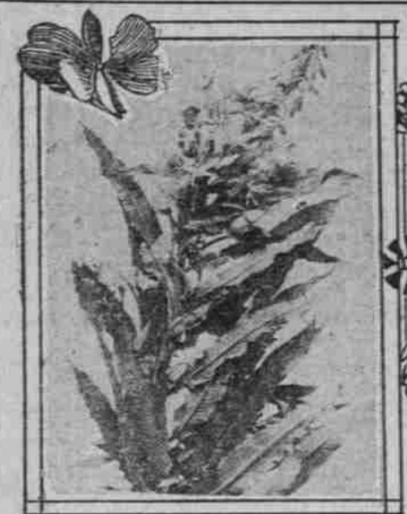
Upper Portion of Giant Fireweed.