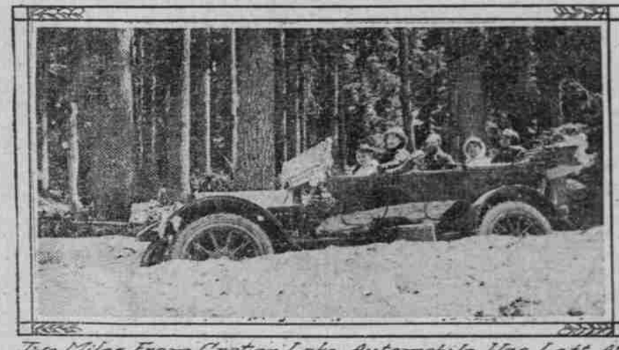
Two Miles From Crater Lake, Automobile Was Left At This Point

Governor's Party Opens Season With Visit June 24 and 10,000 Tourists Are Expected at Resort During Season.