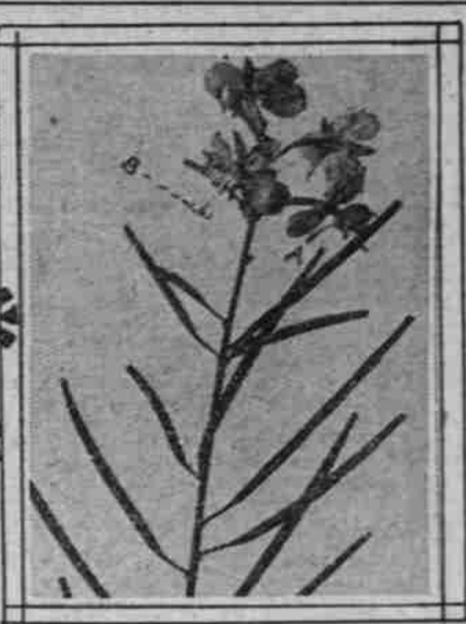
Giant Fireweed, Flower Cluster and Seed Pods.

A more detailed study of the flower shows the calyx of four green lobes united to each other below and continuous with the outer covering of the pod. The four petals are attached to the calyx and alternate with its lobes. There are eight stamens also attached to the calyx. A single pistil grows from the top of the ovary or seed pod, and at its upper end divides into a four-parted stigma which opens when the stigmatic surface is receptive to the pollen. (Figure 2.) As the plant matures these parts drop away, leaving the pod to elongate and enlarge. A cut across a pod shows that it is divided into four cavities and vertical rows of seeds attached to the center. When the pods are ripe they split lengthwise into four valves which open and allow the seeds to escape. Each seed is provided with a coma, or cluster of hairs, for the purpose of wind dissemination. (Figure 3.) The two lower flowers of figure 2 show clearly that this is a case of obligate cross-pollination. In the right-hand individual the pistil is depressed and the stigma closed (figure 2A), while the stamens are erect and