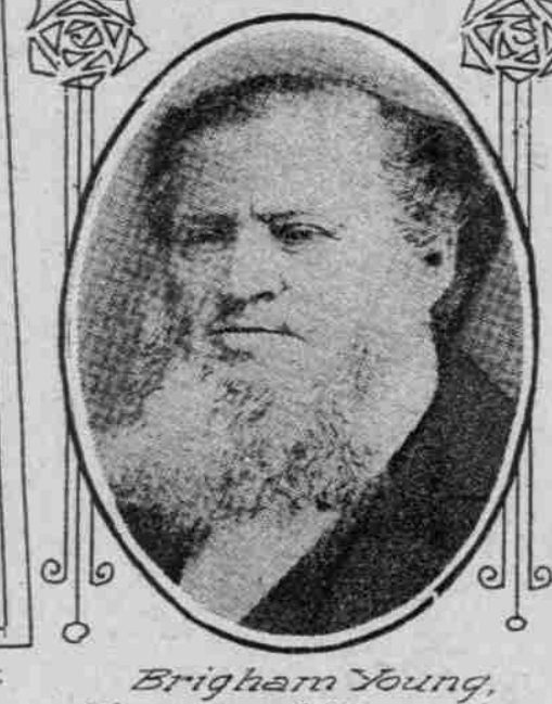
Founder of Present System of Church Schools.