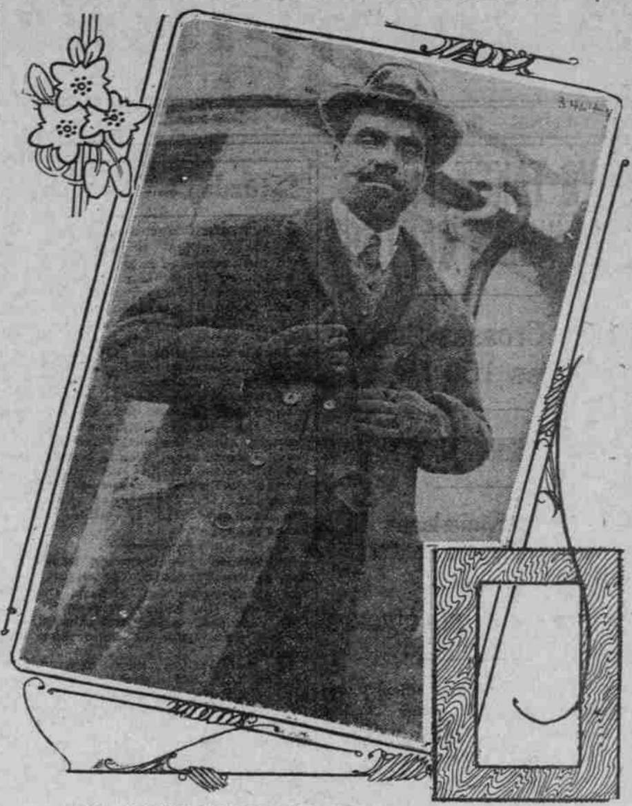
SIR JAGAJIT SINGH, MAHARAJAH OF KAPURTHALA.

EAST INDIAN PRINCE ON VISIT TO UNITED STATES WHO WAS ROBBED BY HOTEL THIEF IN SALT LAKE CITY.