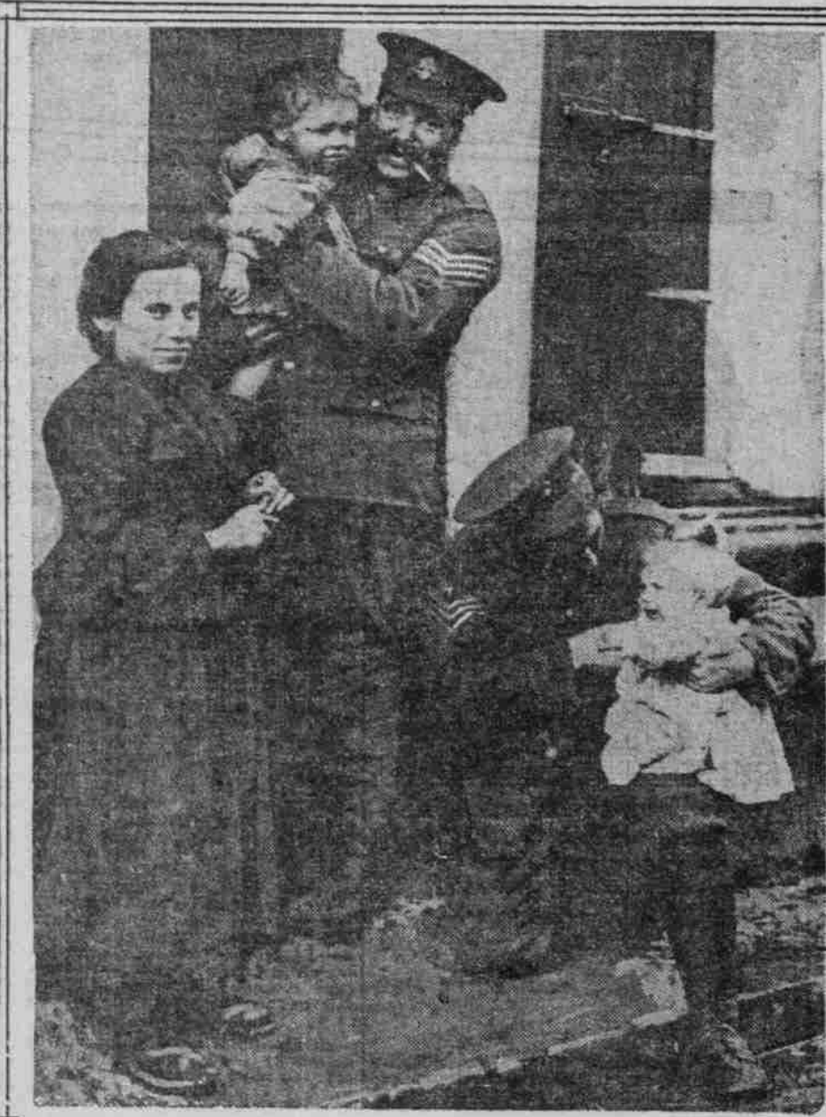
Members of Kitchener's 'Big Army' seem efficient in Waterloo and — Nursing. — Underwood.