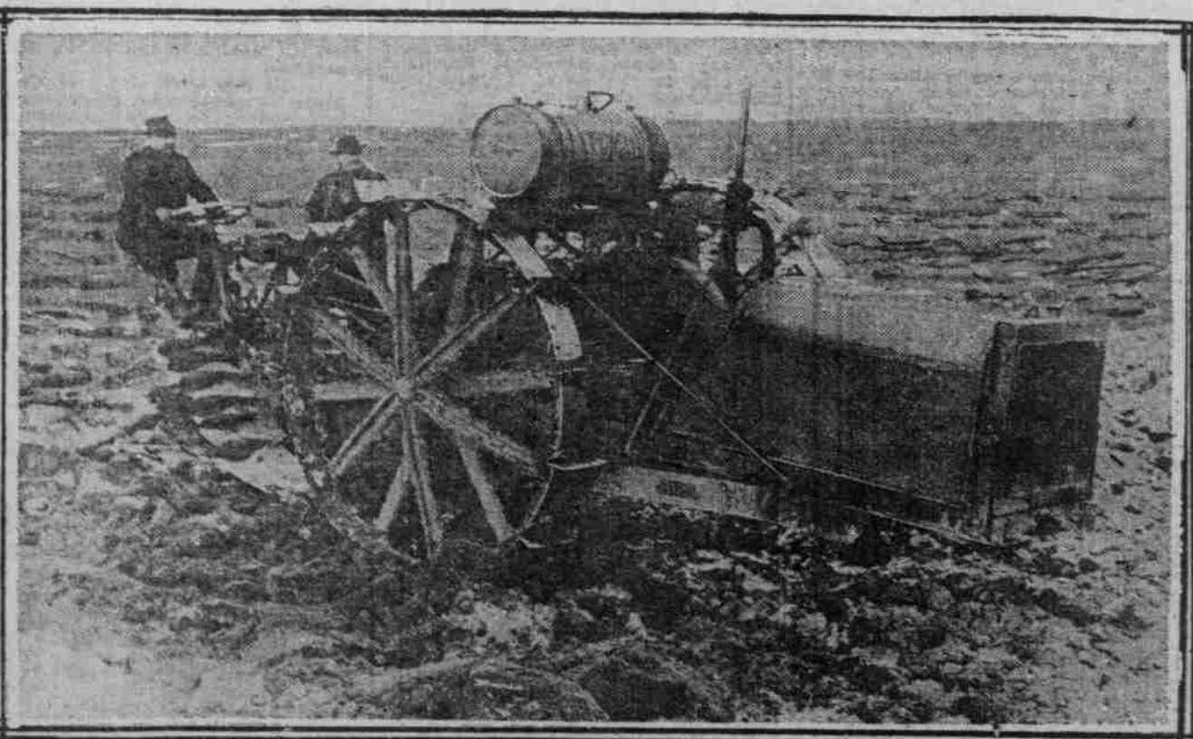
Tempelhofer Field, Berlin, plowed for potatoes. — Bain News.