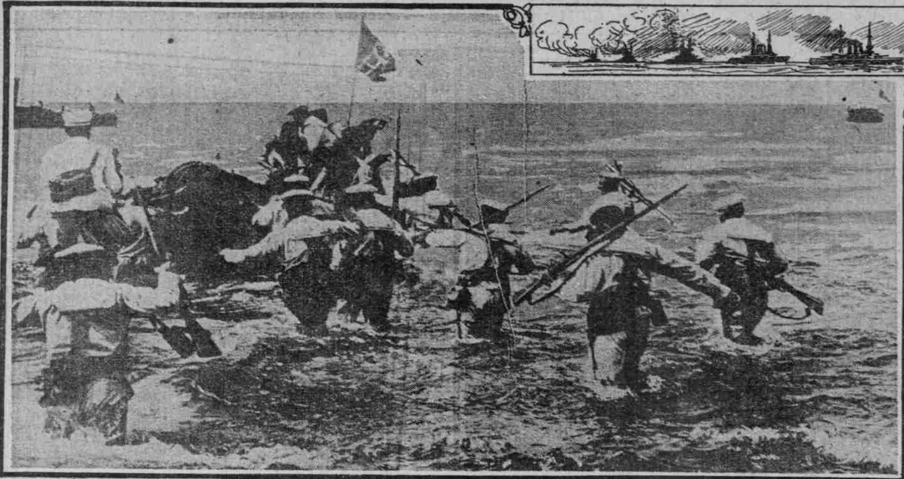
Italian Marines, who may figure in the fighting against Austria, wading through water. — Underwood.