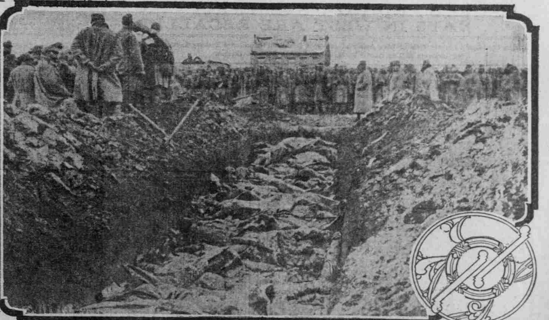
Burying the Dead Austrians on the Battlefield before Przemyśl.