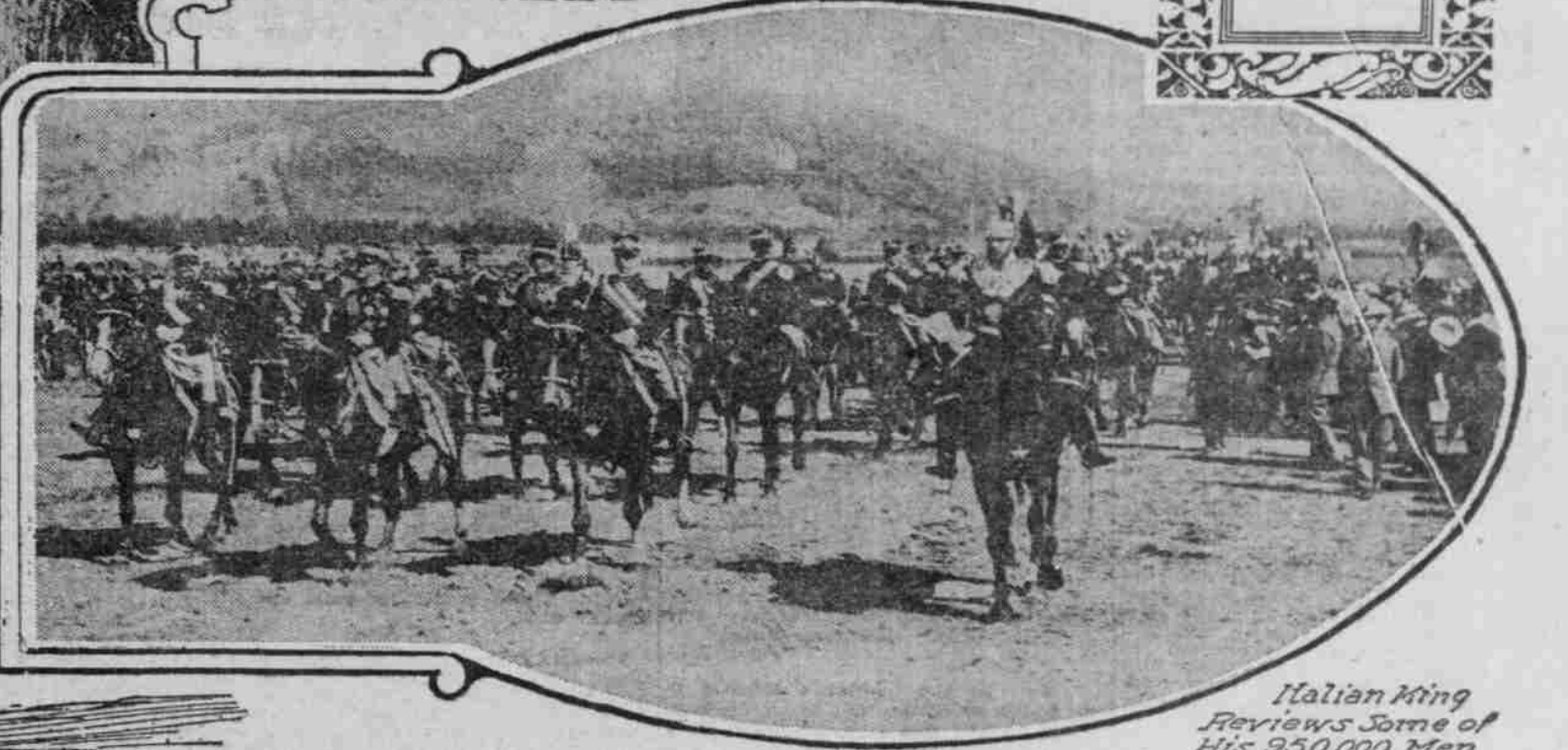
Italian King Reviews Some of His 950,000 Men Under Arms.