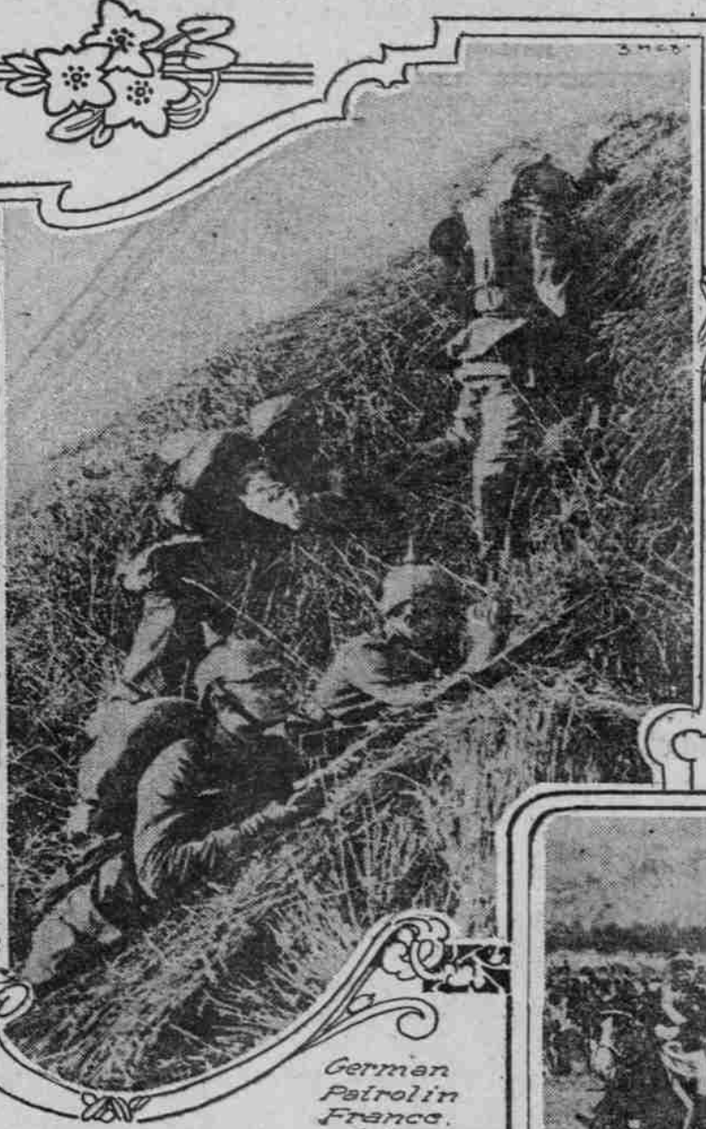
German Patrol in France.