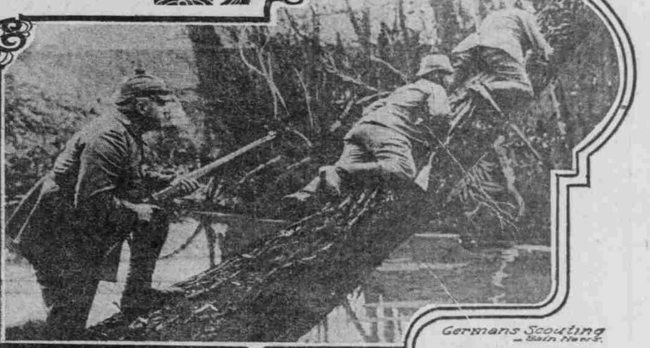
German Scouts.