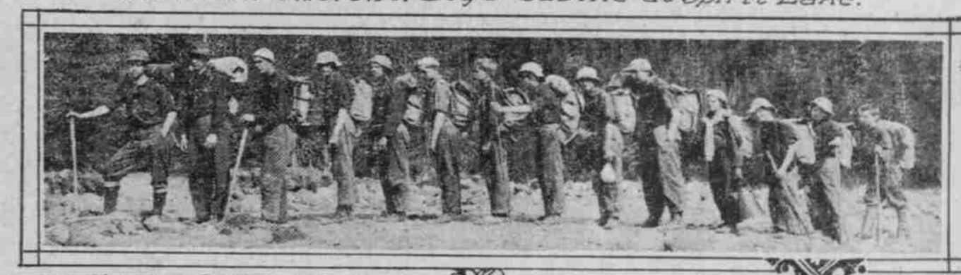
On the Way to Spirit Lake.