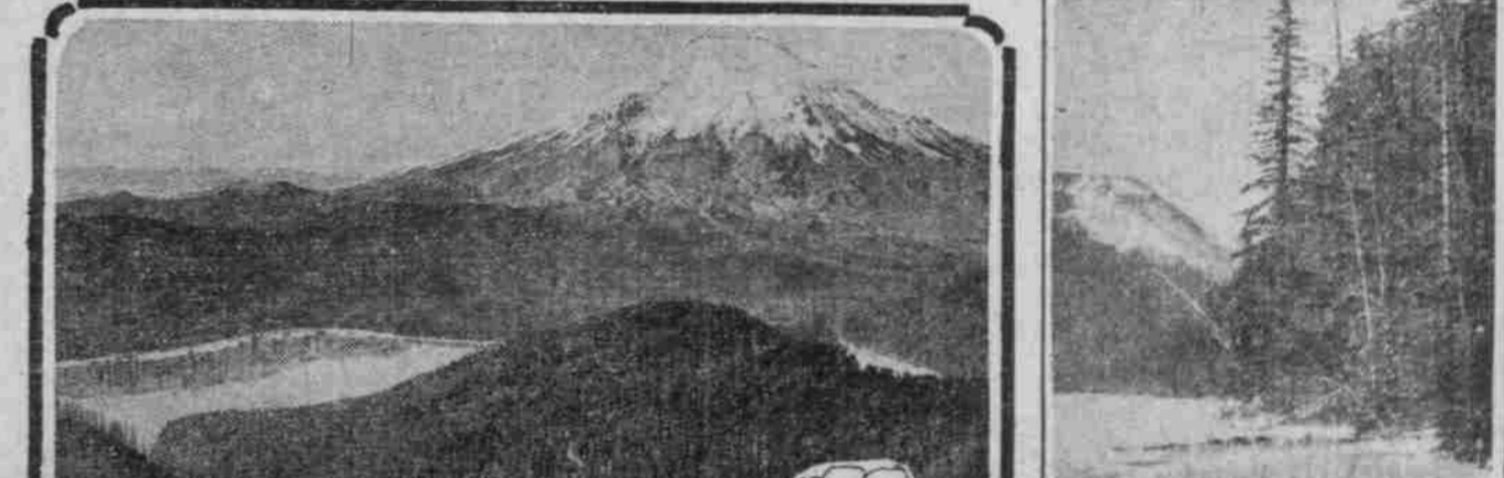
Spirit Lake and Mt. St. Helens.

TWO HUNDRED Portland boys this year will be inhabitants of the little city that for nine weeks in the summer nestles at the foot of Mount St. Helens, on the south shore of Spirit Lake and in the heart of the Columbia National Forest. The youngsters in this boy city is 12, the oldest is 18.