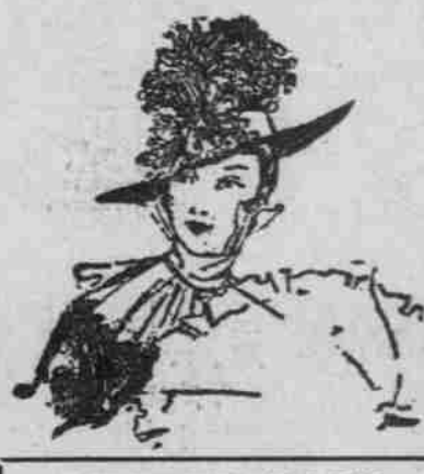
MILLINERY SALONS SECOND FLOOR