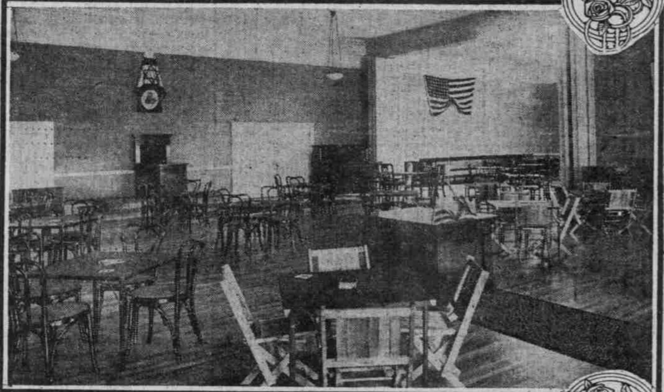
Lodge Room Arranged for Card Party