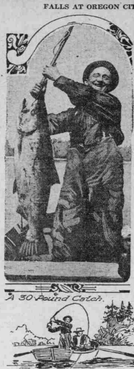
One of the most popular, as well as the best known, fishing places in the state is below the falls at Oregon City. Hundreds of sportsmen already have journeyed to this spot...