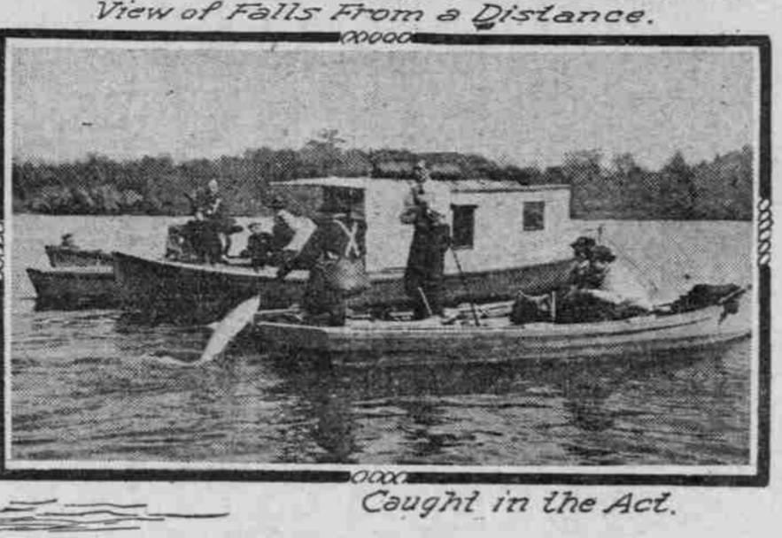
SPOT THAT DRAWS HUNDREDS OF ANGLERS. The best known, fishing places in the state is below the falls at Oregon City...