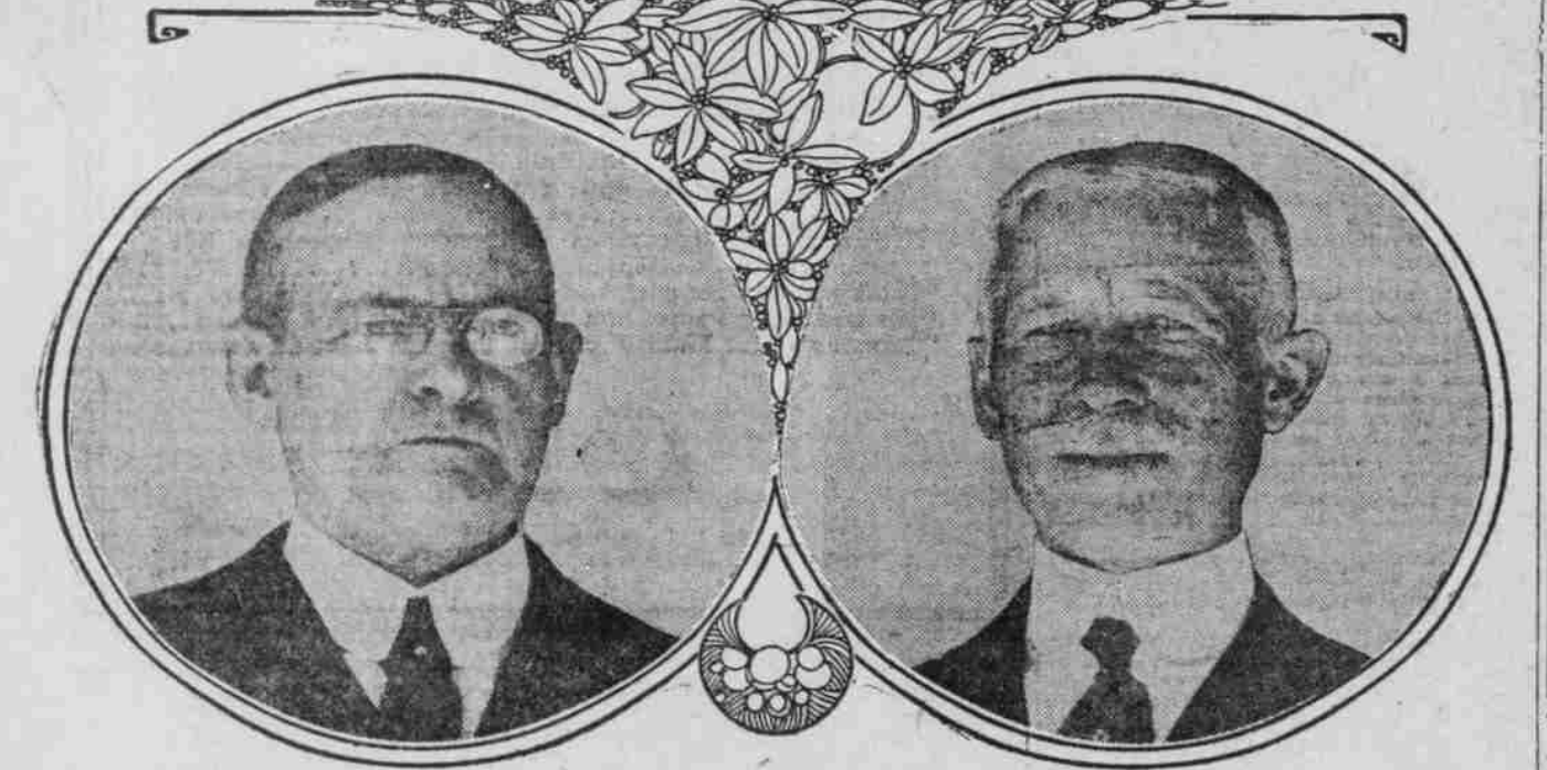
Charles S. Hamlin, Governor of Federal Reserve Board, of Washington, D. C.

Washington at Fifth Street "The Home of Good Furniture" Morrison at Second Street