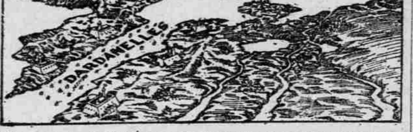
Allied Fleets Are Still Within the Narrow Straits, Although Outer Forts Have Been Reduced and Others Are Gradually Falling One Within the Sea of Marmora.

pealing smile) it is for the sake of our country." Wounded Crow Vienna Cafes. In Vienna, of course, one sees much more real war than any city in Germany. It is there that all the wounded come. The only decent hospitals in Austria are there, and the accommodations in ambulances are so poor that trailers full of wounded are hitched on all the streets.