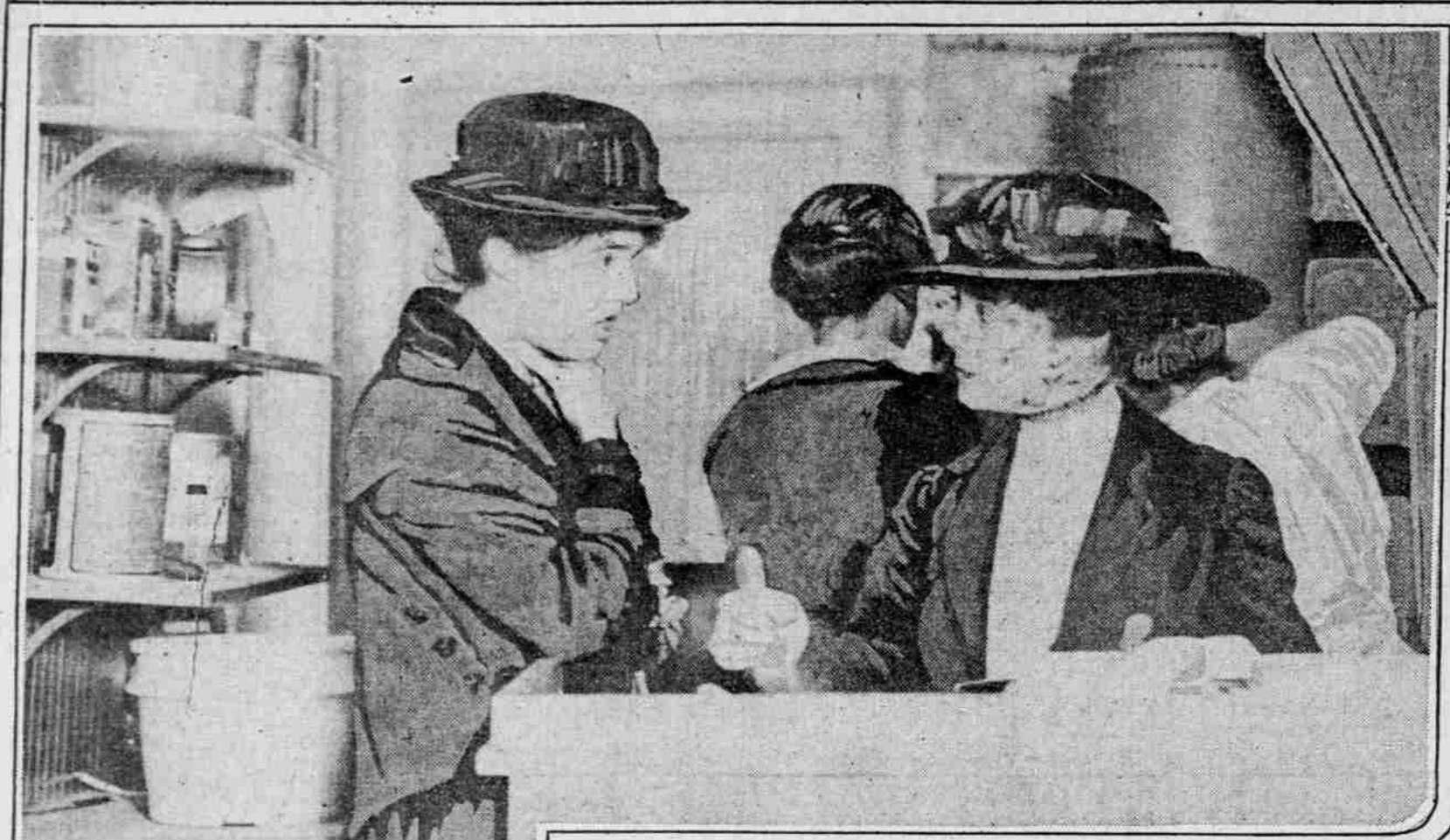
European War Tactics Practiced in Sham Fight by New York Guardsmen—American Women Aid Germans—People's Kitchen in New York Draws Extensive Patronage.