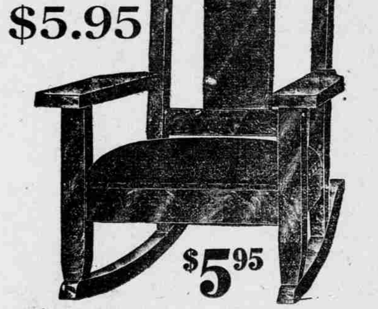
This Quarter-Sawed Oak Rocker, with genuine leather spring seat, is 22x18 inches, the broad back is 22 inches wide and 34 inches high; from the seat the arms are four inches wide and the front posts are also made of heavy solid oak. Other high-grade rocks $5.95 ask $10. Gadsbys' price.

Convertible Into a Bed With Two Motions $25