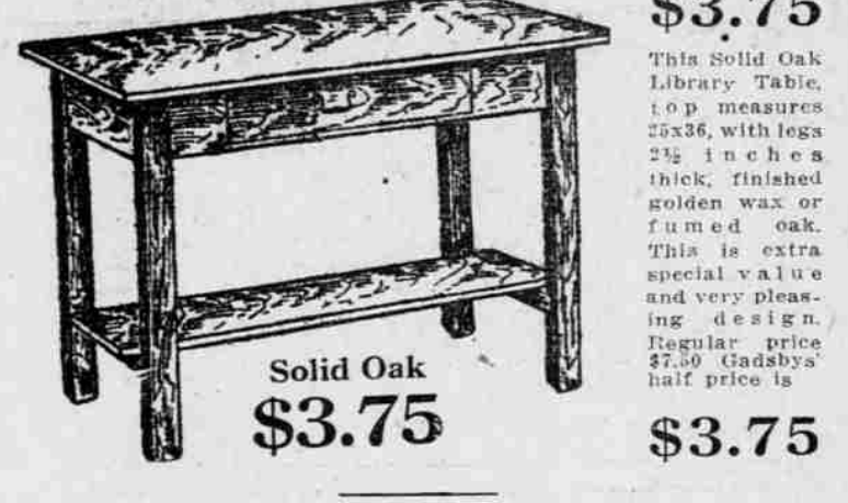
This Solid Oak Library Table, top measures 26x36, with legs 2 1/2 inches thick, finished golden wax or fumed oak. This is extra special value and very pleasing design. Regular price $7.50 Gadsbys' half price is $3.75

$7.50 Solid Oak Library Table Reduced to Half-Price $3.75