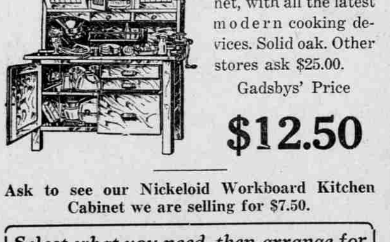
Large, full size, high-grade Kitchen Cabinet, with all the latest modern cooking devices. Solid oak. Other stores ask $25.00. Gadsbys' Price $12.50

Wm. Gadsby & Sons CORNER WASHINGTON AND FIRST STS No Matter What You Want in Furniture Gadsby Sells it for Less