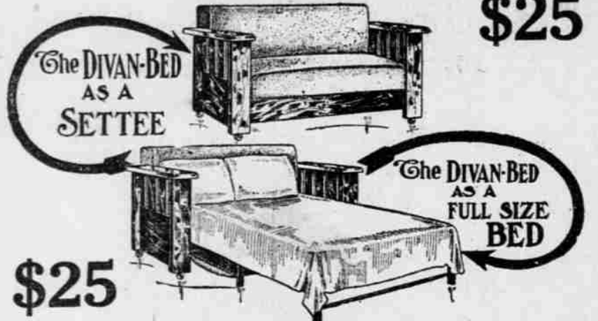
Above is pictured the Duo-Fold Divan Bed when opened up and ready for use as a bed. But two simple motions are all that are necessary to make the chair from divan to bed. It is unnecessary to move the Divan from the wall, the back remains stationary. There is enough space between the springs to allow the mattress and bed clothes to remain when folded up. When used as a bed you do not sleep on the hard upholstery, but on the mattress that can be placed over the springs, thus making your bed as comfortable as a full-sized regulation bed. Gadsbys' price $25

Convertible Into a Bed With Two Motions $25