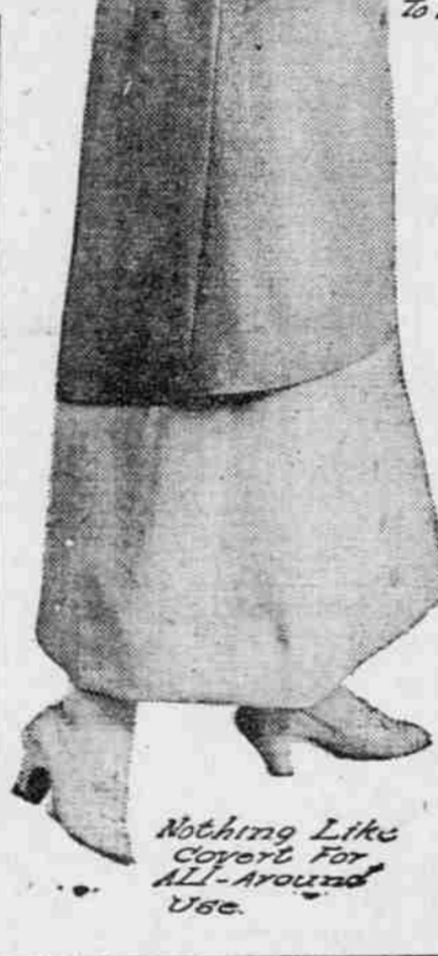
Nothing Like Coverd For All-around Use.

The belt is of red suede with red leather straps, and the full skirt with its new side pockets is short enough to show stockings of natural silk and new pumps without vestige of bow or buckle.