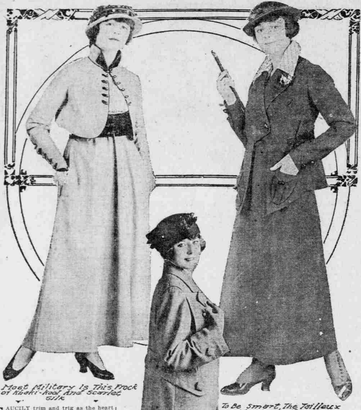
Most Military Is This Frock of Khaki-kool and Scarlet Silk

Brass Eagle Buttons Are in Evidence on Short Jacket, Known as Joffre Coat—Belt of Red Suede With Leather Straps Goes With Full Skirt Above Unadorned Pumps.