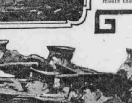
SOLDIERS IN THE TRENCHES ARE REAL CAVE DWELLERS FROM THE SPHERE COPYRIGHT BY H. Y. HERALD

invisible. From here one does not distinguish it even by its thin line of trenches. The infantry is buried in deep holes. The plain is frightfully deserted. Still, some thousands of eyes watch it, some thousands of guns, fixed on the ground, wait threatening silent.