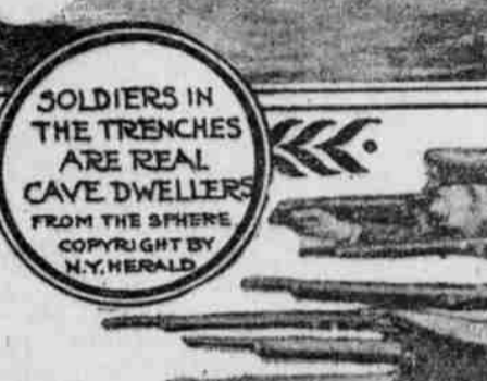
FRENCH CHASSEURS-A-PIED IN THE FIRST LINE NEAR ARRAS.

The man wanted to drag away his booty as far as his entrenchment; this time a ball struck him. Two of his comrades boldly tried to replace him; they arrived at the tree and dragged it some yards. They were killed. There came still two others and after those two more. This fighting for a birch tree lasted several hours. The tree was at length taken away. It had cost the Germans 23 men.