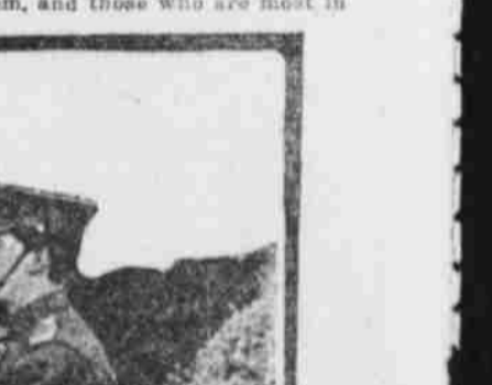
TEMPORARY TRENCHES—A BRITISH DOG SENTRY IN THE FOREGROUND

advance, caught by the intricacies of the twisted wire, fall heavily. We shoot into the bunch with a joyous exultation. We are panicking and the preparation pours from our temples. A furnace is burning in each heaving breast.