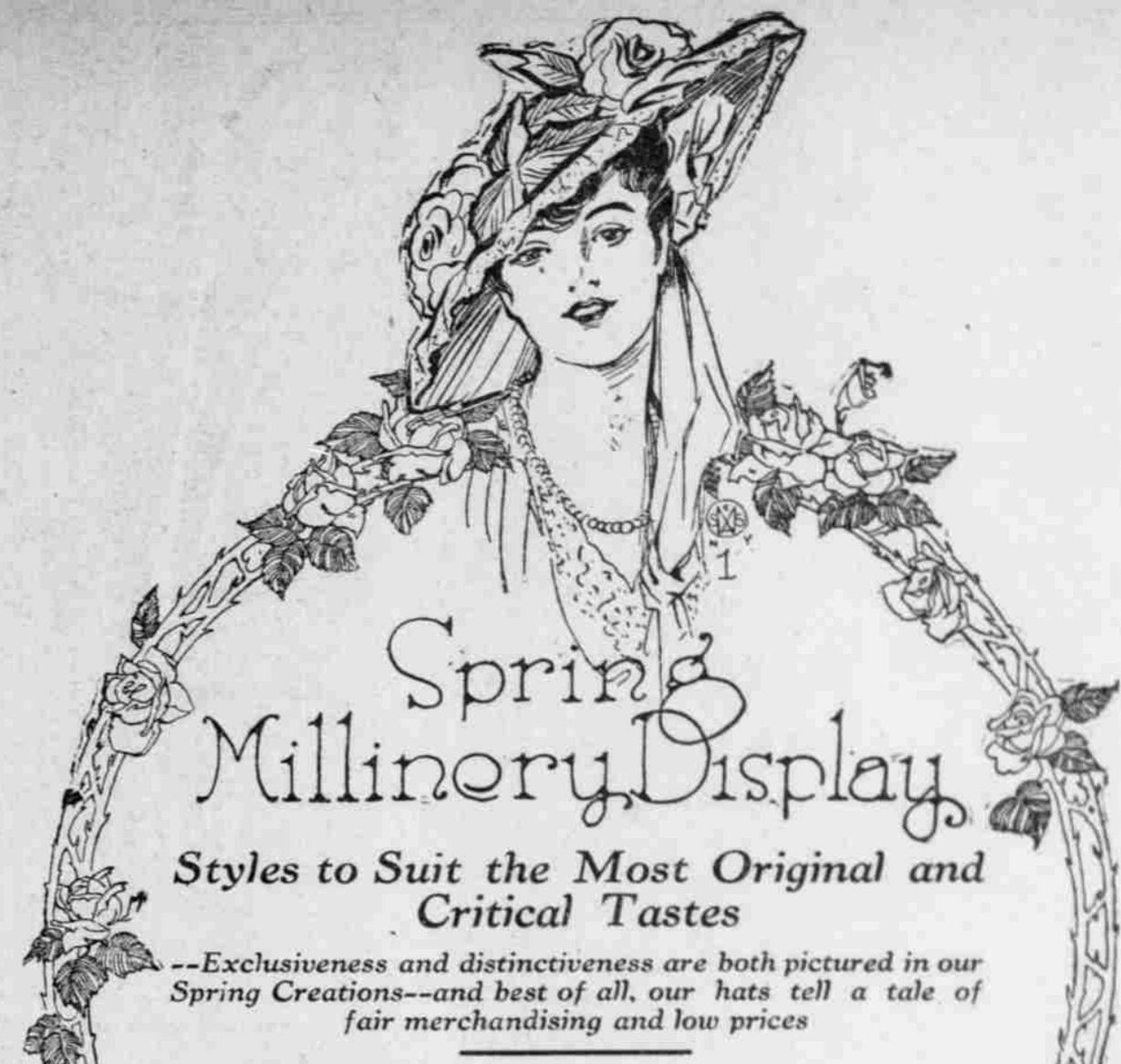
Spring Millinery Display Styles to Suit the Most Original and Critical Tastes

Exclusiveness and distinctiveness are both pictured in our Spring Creations--and best of all, our hats tell a tale of fair merchandising and low prices --We think you could find no prettier hats in America --It will be a pleasure to show you about, particularly so tomorrow The Wonder Millinery At Morrison and Fourth Streets