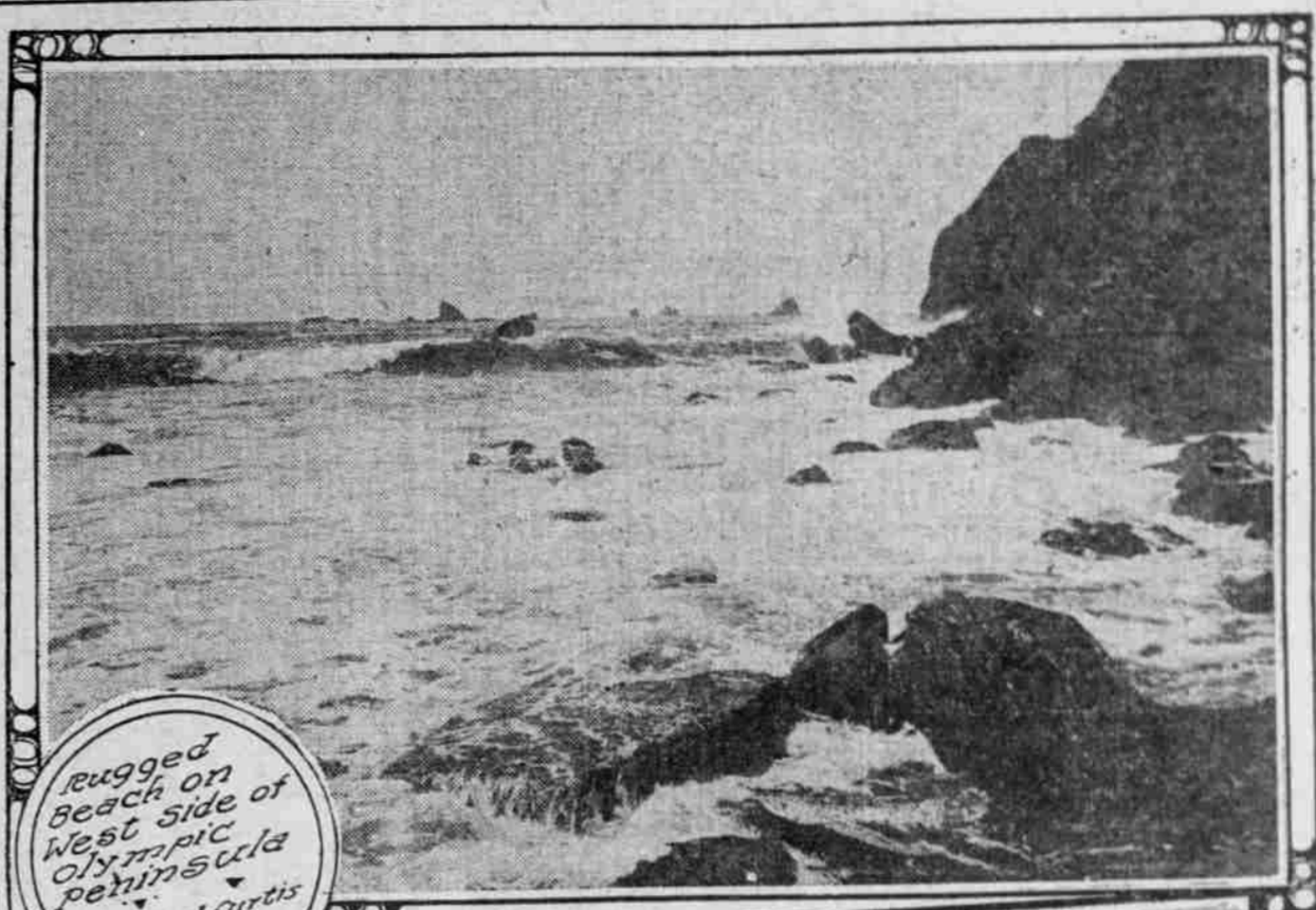
Reached Beach on West Side of Olympic Peninsula

Sea, Mountains, Lakes and Thousands of Acres of Fertile Land in View From Scenic Road Winding Around Mysterious Olympics—All but 55 Miles of Domain-Developing Boulevard Complete.