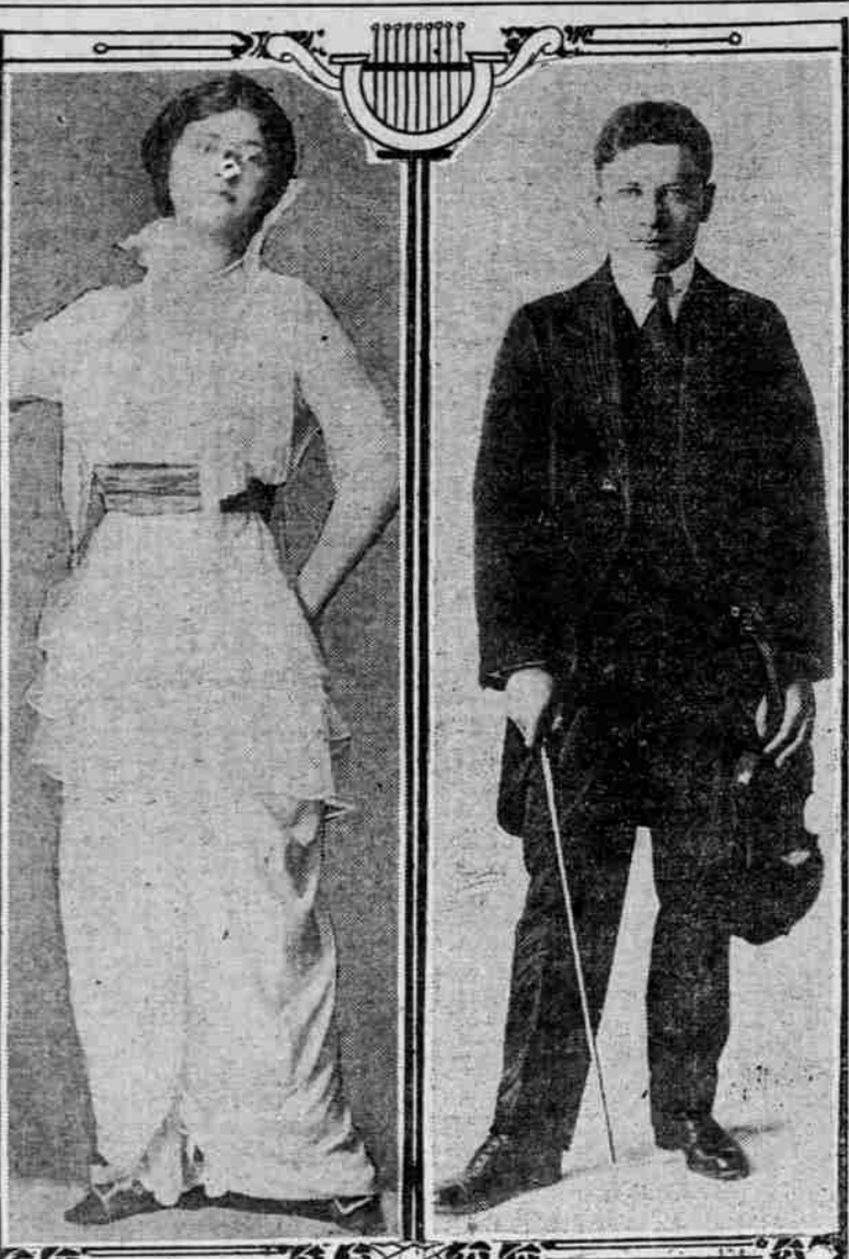
ALMA GLUCK AND EFREM ZIMBALIST.

Efrem Zimbalist Will Also Take Part, and Heilig Theater Expects Record-Breaking Attendance.