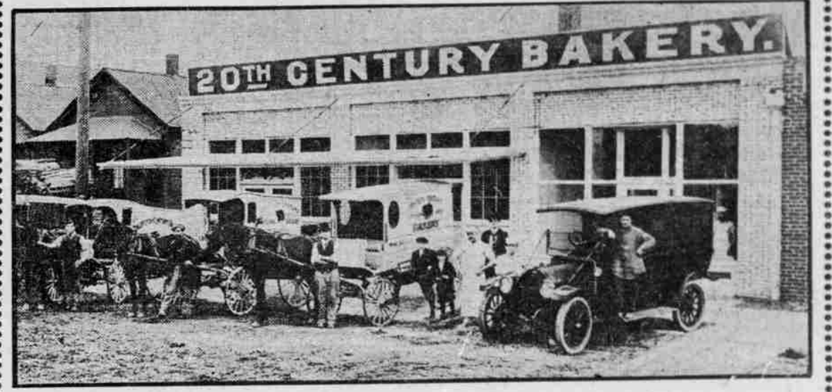
EXTERIOR VIEW, WITH DELIVERY AUTOMOBILES AND WAGONS.

The Twentieth Century Bakery is now located in its new sanitary and modern building, which was especially constructed for it at 150 Page street, near Borthwick street, in Albina. The rapid growth of its business in recent years has made it necessary for a bakery of this size, equipped with all the latest bakery appliances and with a capacity of 10,000 loaves daily. The bakery is a model of cleanliness, and an abundance of light is one of the features, which is so essential in the bakery business.