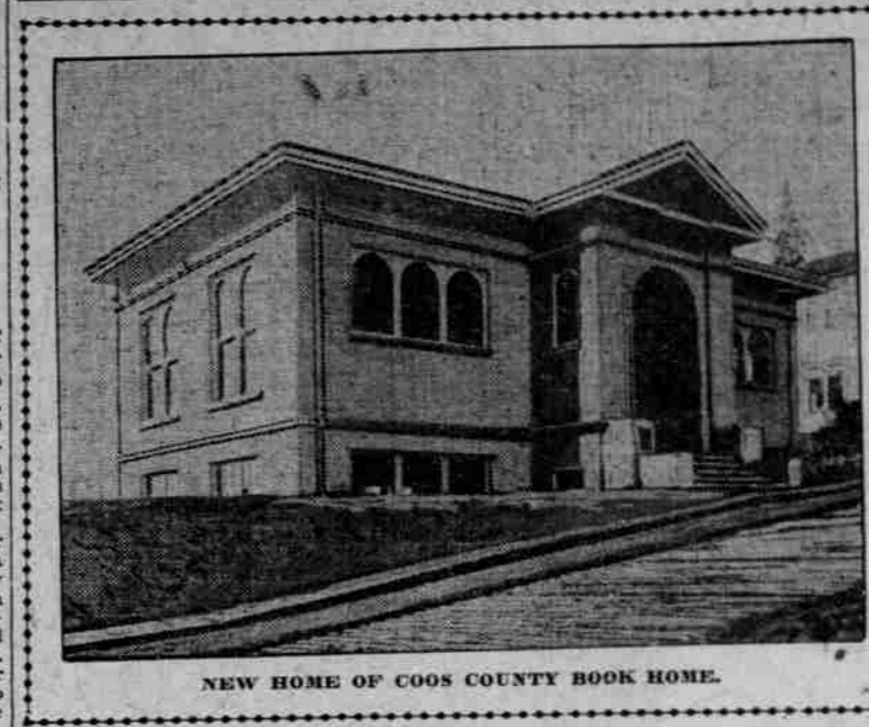
NEW HOME OF COOS COUNTY BOOK HOME.

Event Marks Successful Accomplishment of Task Undertaken in 1907 by 36 Women, Members of Progress Club, and Few Others.