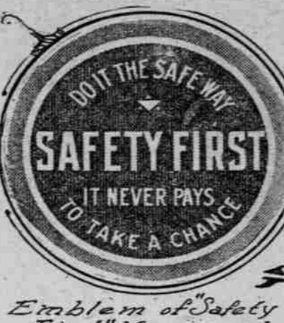
Emblem of "Safety First" Movement.

Records of Campaign by Car Company Show Decrease From 38 Accidents Daily to Eight—Employer, Employee and Pupil Serve on Many Committees—Machinery Appliances Aid Work Everywhere.