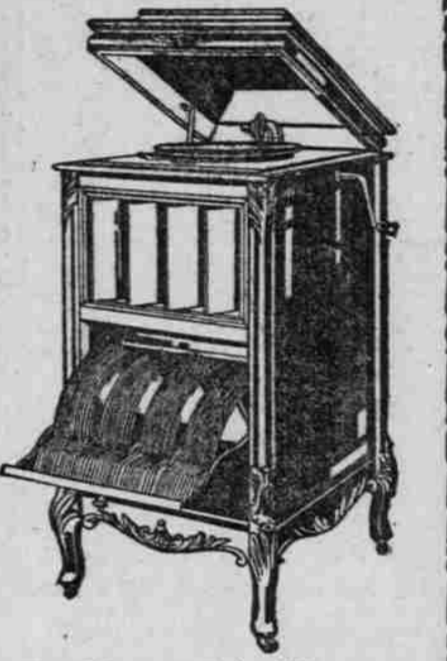
The "Mignonette" for $100 most resembles the $200 "De Luxe." As a compromise between the bigger, higher-priced, fully cabinet, elaborate uprights and the smaller instruments, the "Mignonette" has proved to be exactly what thousands of careful people had in mind. We are proud of the "Mignonette," and you will be proud of yours if you select it and let its music start the day on Christmas morning.

Other Type Grafonolas $25 and Up AT YOUR DEALER OR Columbia Graphophone Co. 429-431 Washington St., Between 11th and 12th OPEN EVENINGS TILL CHRISTMAS