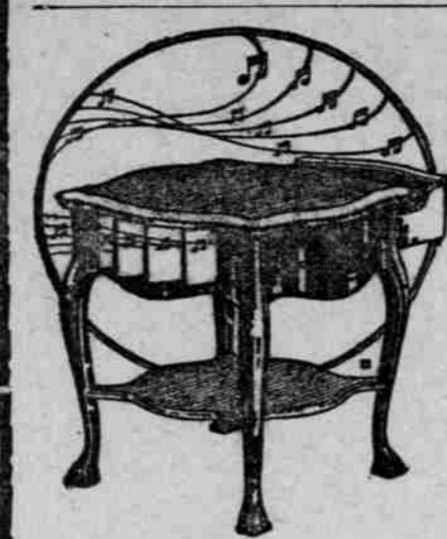
"BABY REGENT"—$100 Mahogany or Quartered Oak (Golden, Fumed or Early English.)

All the music of all the world, always at your command. Can you possibly decide on any one thing that will give so much pleasure, to so many people, for so long a time, at so little cost?