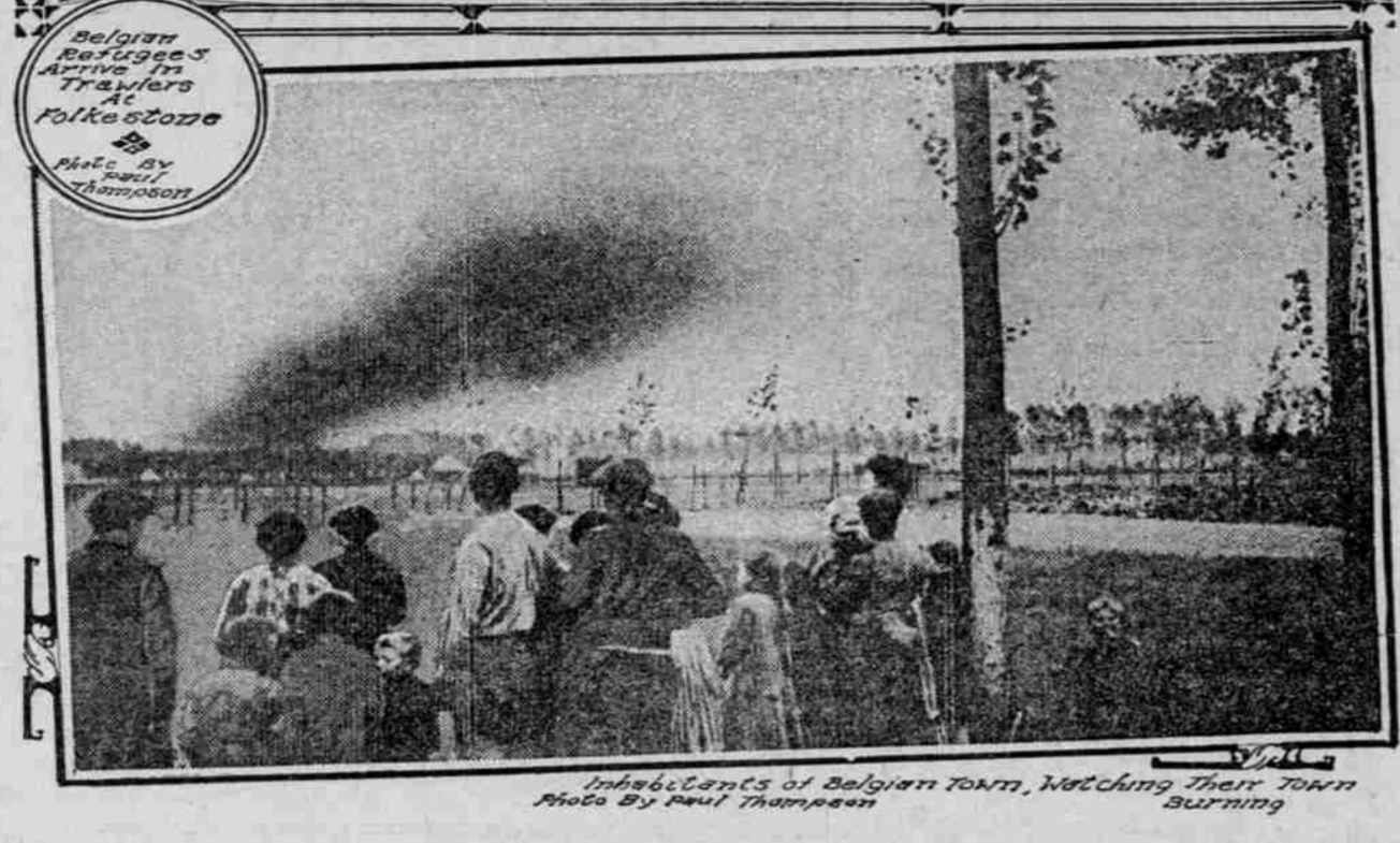
Inhabitants of Belgian town, watching their town being burned.