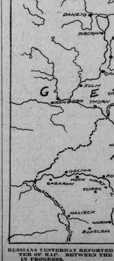
RUSSIANS YESTERDAY REPORTED GAINS TO NORTHEAST OF LODZ, WHICH IS SHOWN NEAR BOTTOM CENTER OF MAP. BETWEEN THE VISTULA AND WARTHE RIVERS, SHOWN ON MAP, HEAVY FIGHTING WAS IN PROGRESS.