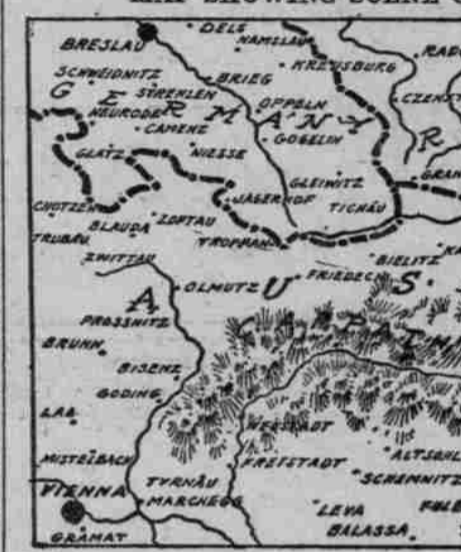
CRACOW, NEAR CENTER OF MAP, IS ALSO CENTER OF HOSTILITIES IN THIS DISTRICT. RUSSIAN REPORT HAVING REPULED TWO ATTACKS HERE YESTERDAY.

charter. The general state and county tax, which was 20 mills last year, is placed at 19 mills this year, and the school tax, 8.3 mills, has been reduced to 5.7. The largest reduction is in the district school levy.