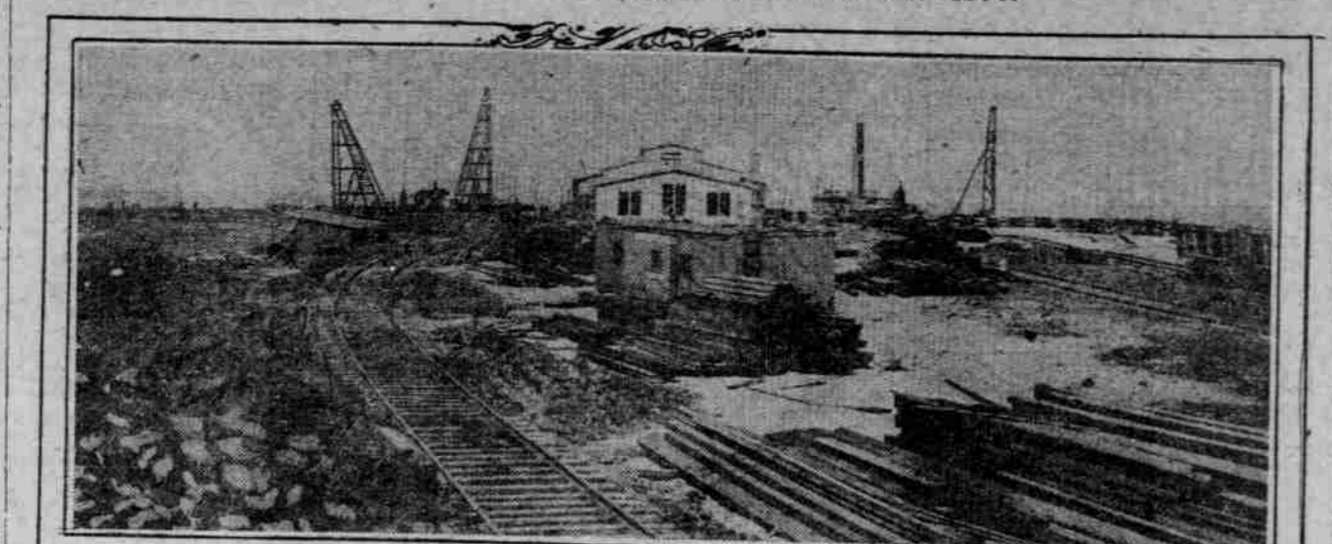
North Bank Docks Being Built at Flavel