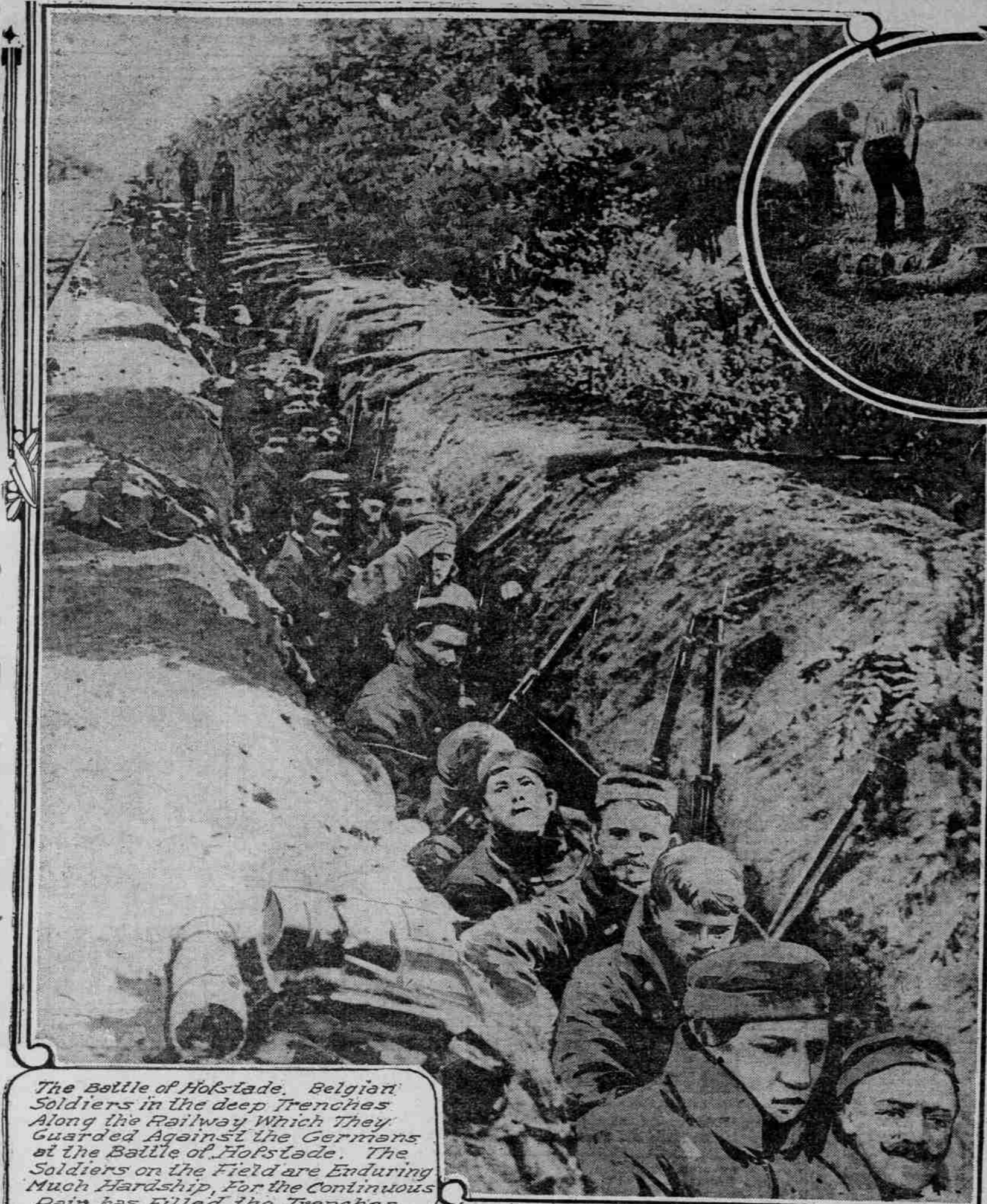
The Battle of Holstede. Belgian Soldiers in the deep Trenches Along the Railway Which They Guarded Against the Germans at the Battle of Holstede. The Soldiers on the Field are Enduring Much Hardship, For the Continuous Rain has Filled the Trenches With Water.