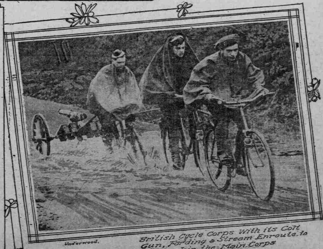
British Cycle Corps With its Colt Gun, Forging a Stream En-route to Join the Main Corps.