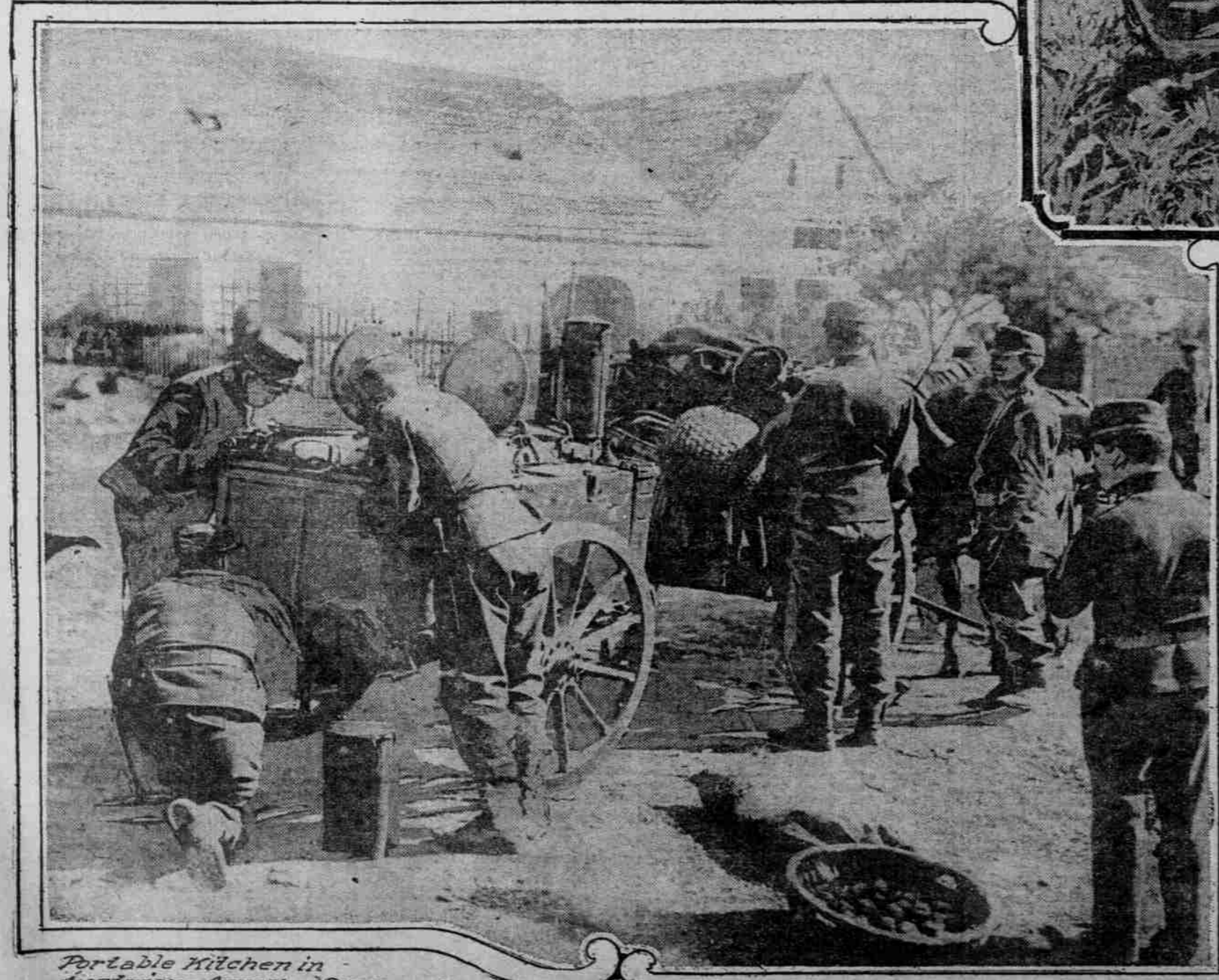
Portable Kitchen in Austrian Army.