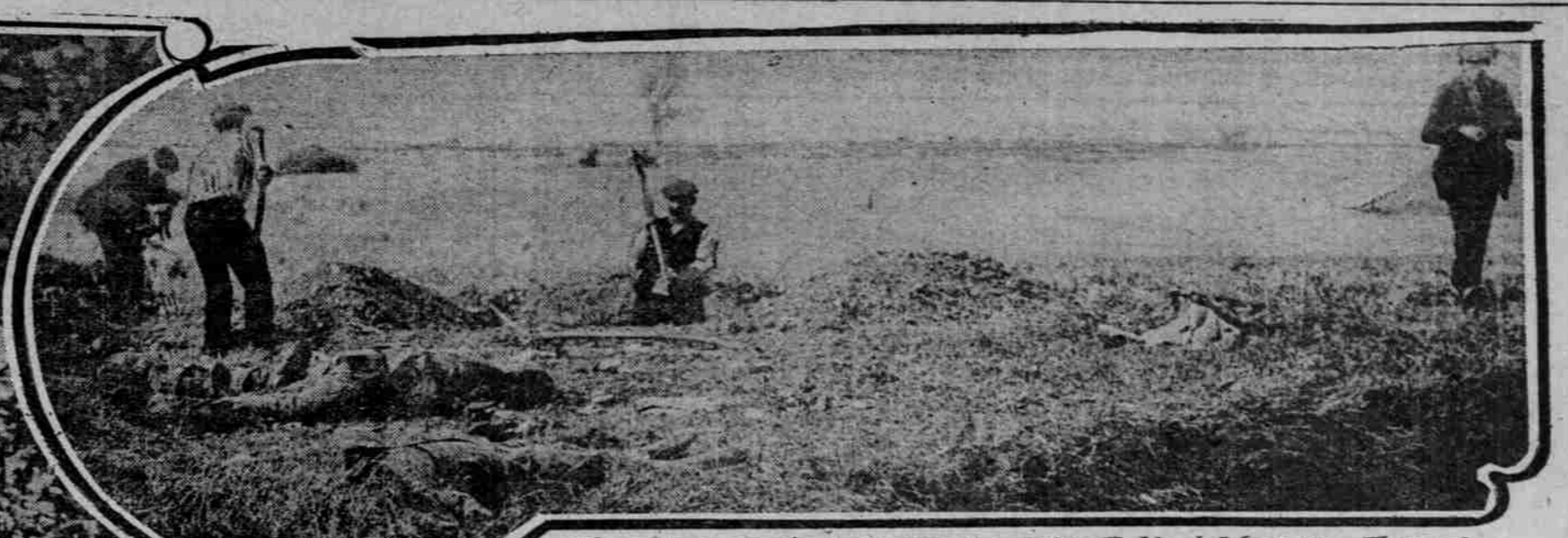
French Burying Germans Who Fell at Meaux. French Peasants Burying the Germans Lying in the Trenches Where They Fell at the Battle of Meaux. The Trenches Extended for Miles, and the Retreat was so Rapid that the Germans were Compelled to Leave Their Dead Unburied.