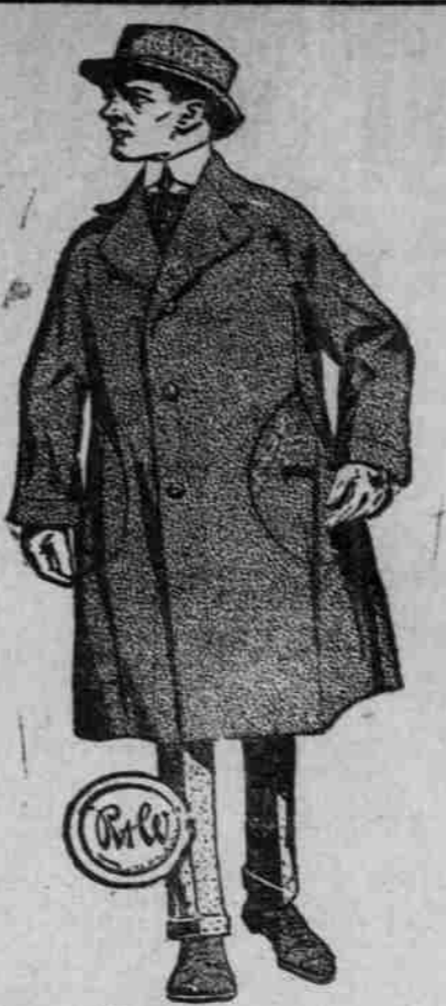
Designed by Rosenwald & Weil, Chicago

Rheumatism depends on an acid which flows in the blood, affecting the muscles and joints, producing inflammation, stiffness and pain.