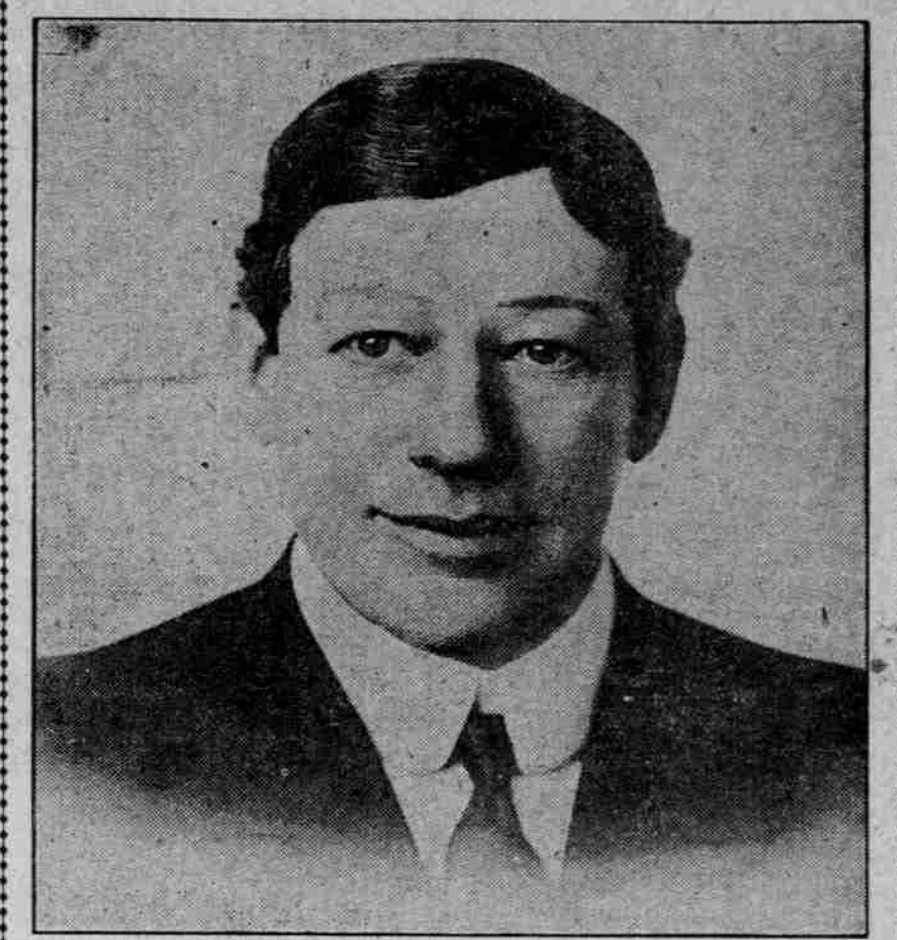
DE WOLF HOPPER.

Actor's History Includes Records of Long List of Productions, Starting With "Castles in the Air," Presented First in New York.