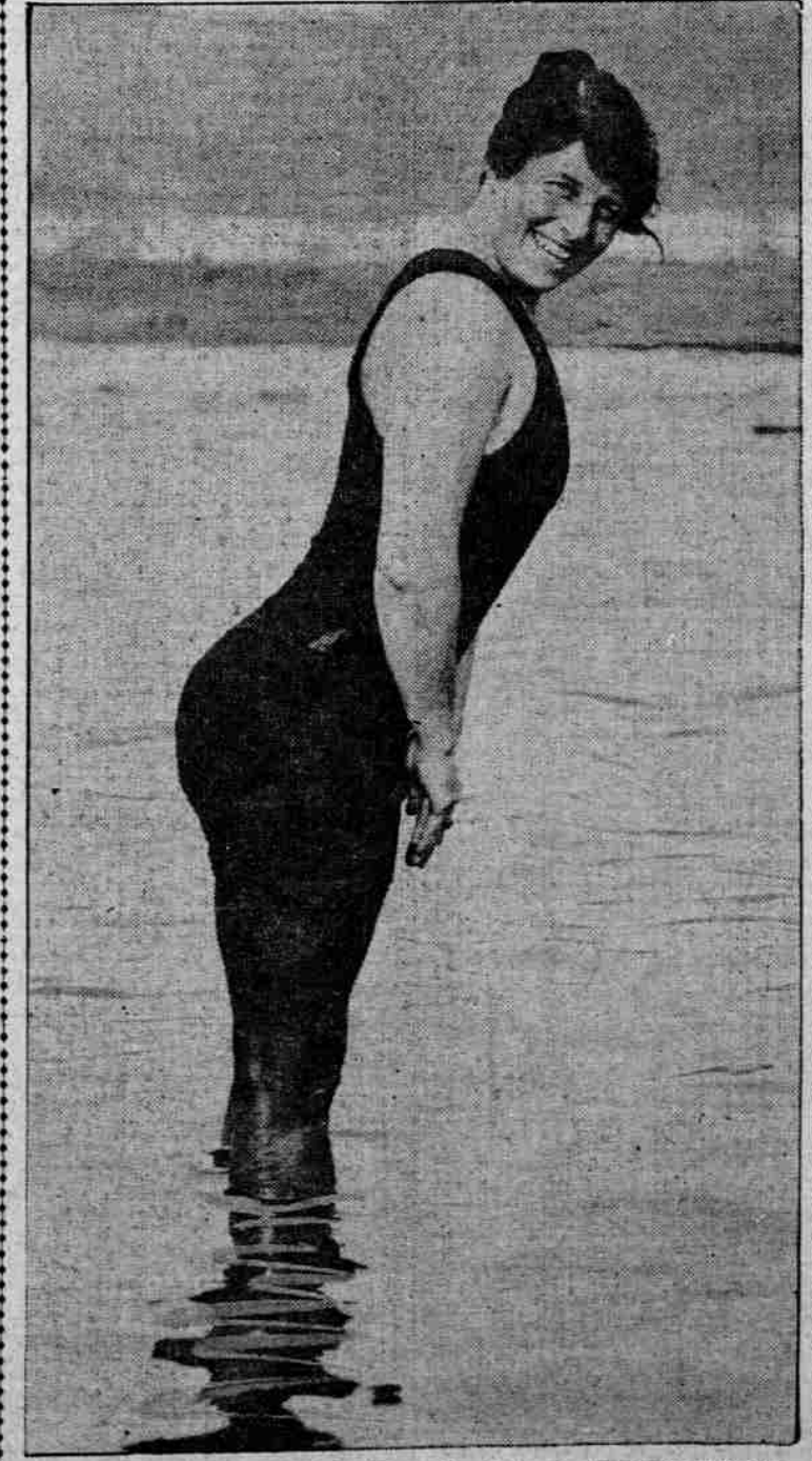
That Miss September Should Smile. Poss t Did Not Have as Warm Water as the yn. Good Crowds Still Go Bathing Daily.