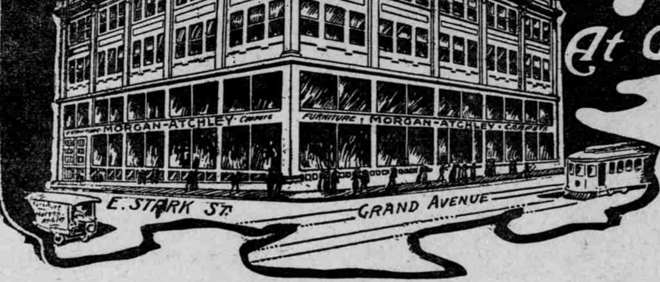
All Streetcars Transfer to Cars Passing in Front of Our Store

An Economy Pointer to Buyers of Furniture, Carpets, Etc.