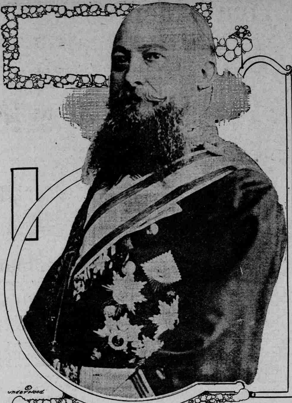
HIGH-ADMIRAL ALFR. ED. P. T. VON TIRPITZ.