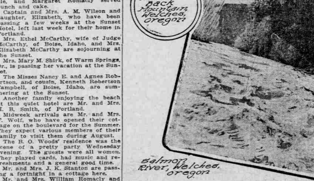
View on Salmor River, Oregon