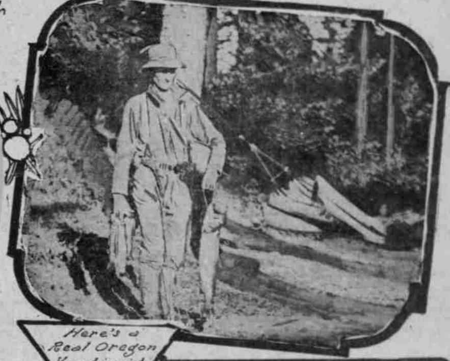
Here's a Real Oregon Vacationist

A ND now for your Summer vacation. Dig out your fishing tackle, your big shoes, the old duck suit, your bathing trunks and the slouch hat and hit the trail. Nature, you will find, has had your comfort and pleasure in mind since last Summer and will be on hand as usual to greet you with big broad smiles whichever way you turn.