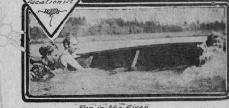
Fun in the River

streams which dash over rocks down canyons into the main stream. Or take the Estacada car and get off at one of the stations along the Clackamas River. You will find fair fishing in the main stream and in the mountain streams which empty into it. If you have a desire to get back away from civilization stay on the car until it reaches the end of the line and from there hike back into the hills. A few miles' walk will lead you into as wild a country as you want with the very best of fishing.