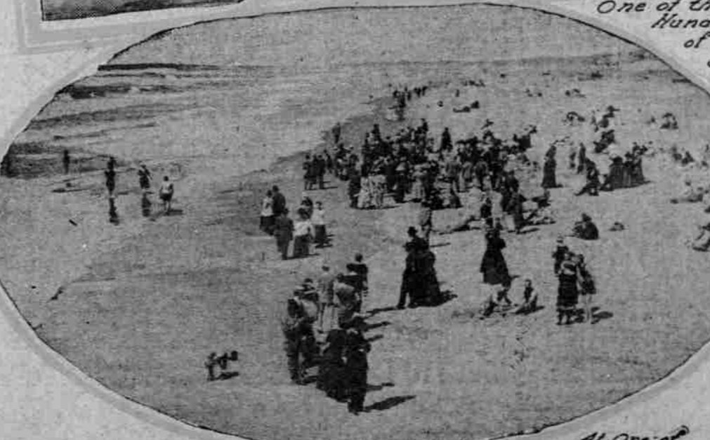
At One of Oregon's Beaches