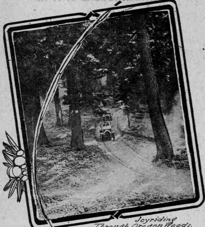
Joyriding Through Oregon Woods.