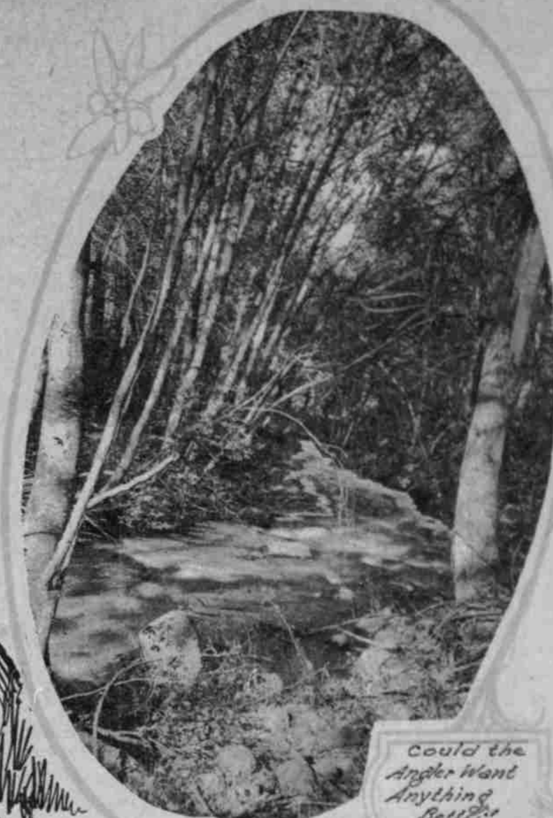
Could the Angler Want Anything Better?