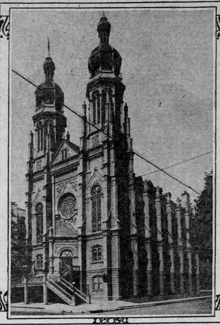
Temple Beth Israel, 12th and Main Streets.