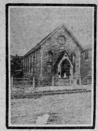
First Synagogue of Congregation Beth Israel.

Early History of Congregation Given and Pounding of Organization in 1858 as First Pillar of Judaism on Pacific Coast Is Recited-Observance of Milestone Is Impressive Ceremony.