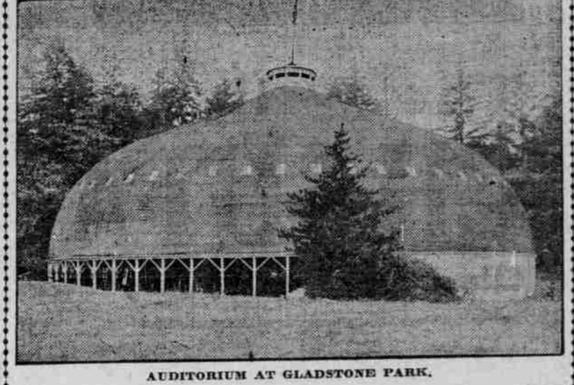
AUDITORIUM AT GLADSTONE PARK.