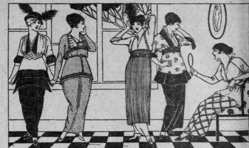
Dresses Illustrated Were Sketched From Models on Sale