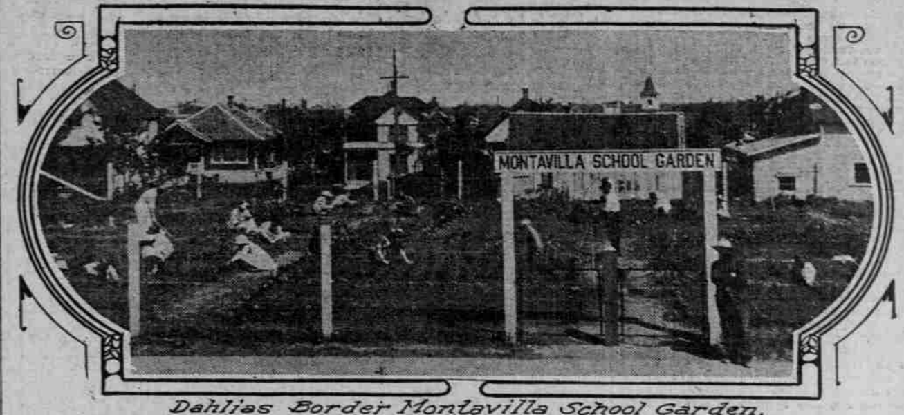
Dahlias Border Montavilla School Garden.

Results in Contests at Hudson, Jonesmore and Other Buildings in Eastern Section of City Are Reported Especially Fine by Officials, Who Inspect 14 Gardens.