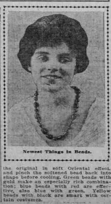
Newest Things in Beads.

IF the pretty woman who sits in front of you at the theater wears a string of gorgeously Oriental beads, large in size and rich in coloring, don't sigh with envy. Look closely at the handsome necklace. You will find those wonderfully colored beads are made of sealing-wax!