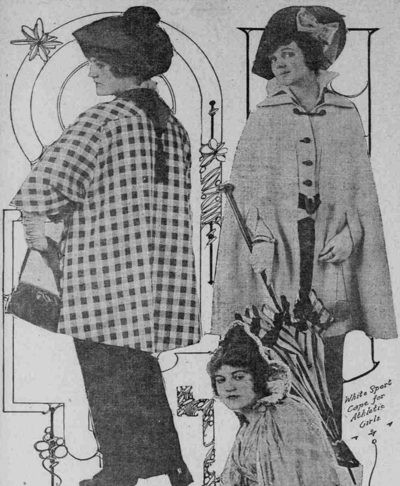
Though Sensational This Cape is Extremely Chic. White Sport Cape for Athletic Girls. Cape Has Its Place in Evening Festivities.

Loudly Checked Garment, Worn by Tall, Stately Figures, Is Not Bizarre, but Aids in Modifying Appearance of Angularity—Motoring Throw-Over Is a "Knowing Sport" Creation.