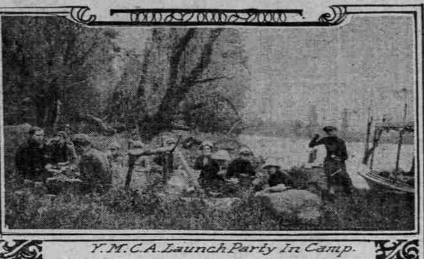
Y.M.C.A. Launch 'Yucca' In Camp.

Tears Come to Eyes of Youths Who Looked Forward to Another Year of River Sport When News of Disaster Is Learned.