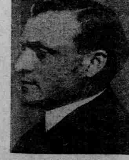
Joint Representative, Clackumas and Multnomah Countles.