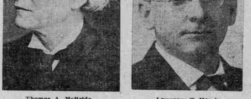
THREE REPUBLICAN CANDIDATES LEADING FOR JUSTICE OF SUPREME COURT.