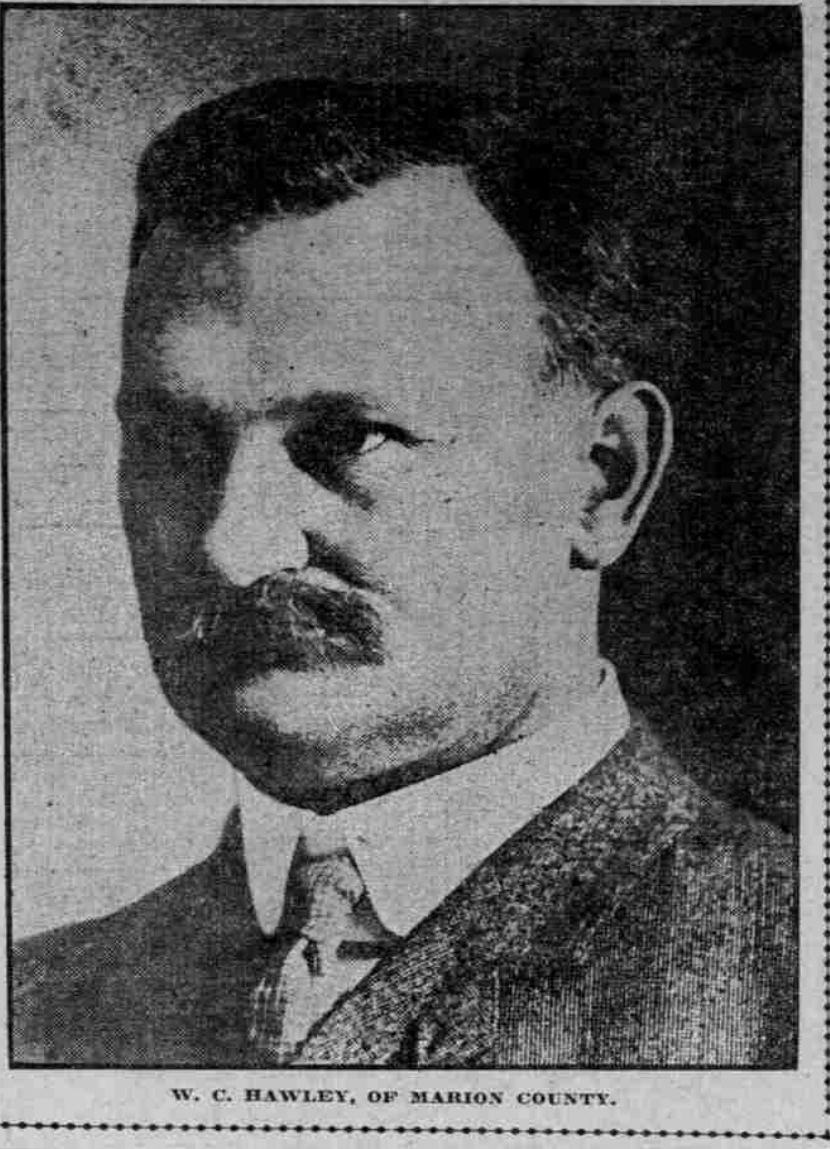
W. C. HAWLEY, OF MARION COUNTY.