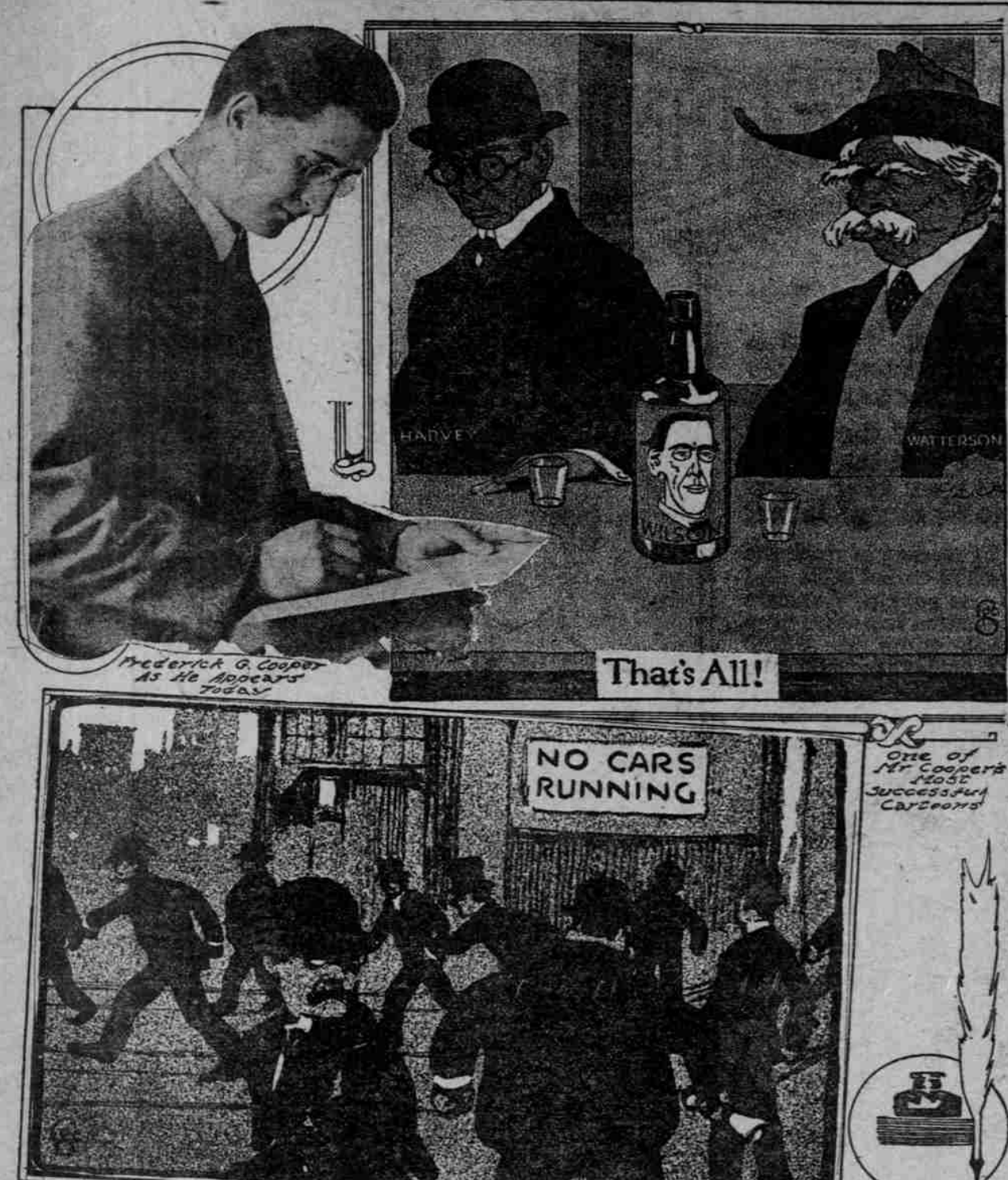
These Are Times That Try Men's Sales

Lad, Who in Earliest 'Teens Drew His First Pictures for Oregonian, Is Now Commanding Princely Income From Leading Magazines of United States-Art Attained Without Technical Education-Worthless Life Predicted.