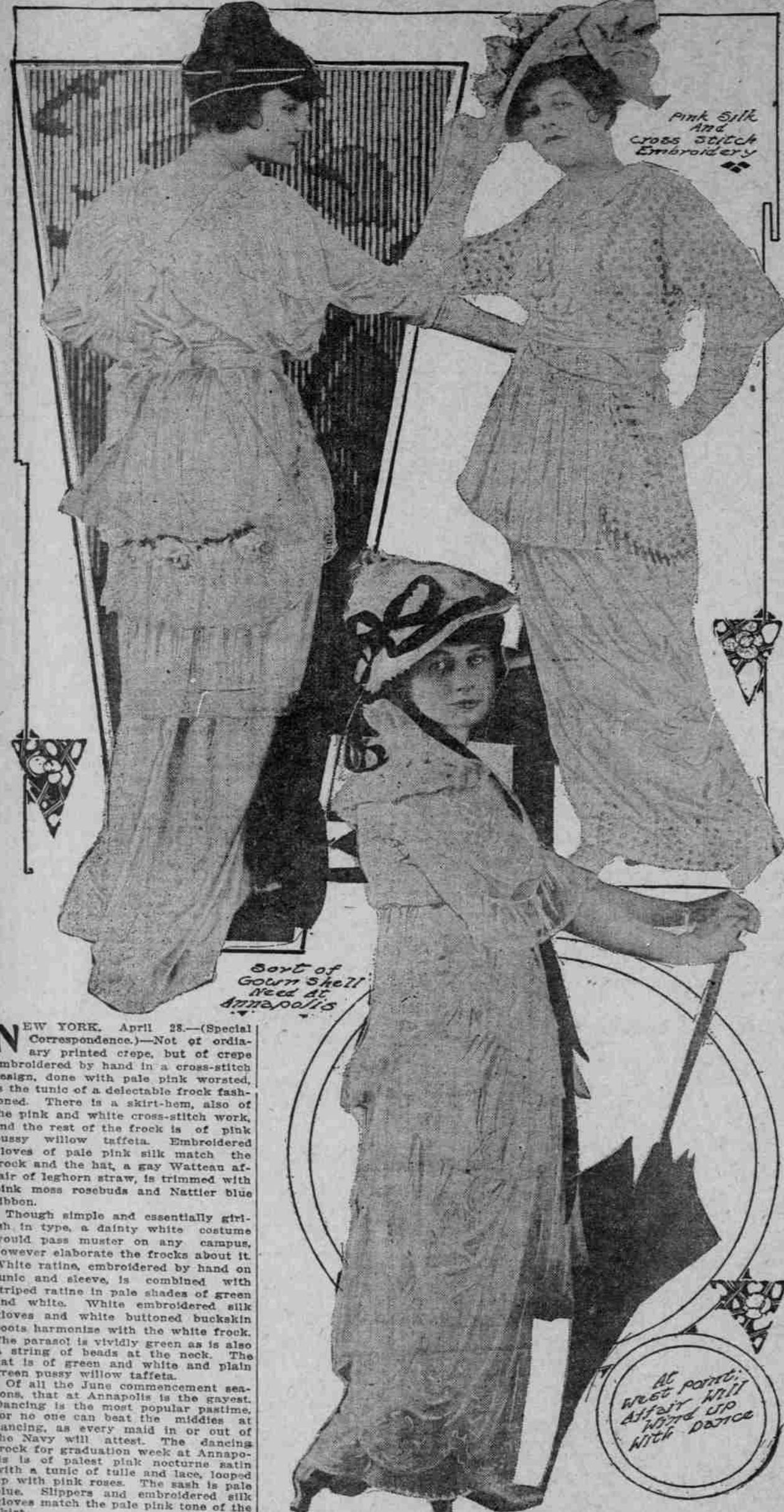
pink silk and cross stitch embroidery

Hand-Embroidered Crepe, in Cross-Stitch Design With Pink Worsted, on Tunic and Skirt Hem, and Pink Pussy Willow Taffeta Material, and Glove and Hat to Match. Makes Stunning Effect—Class Day Gowns Timely.