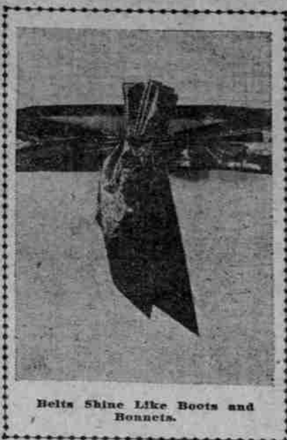
Belts Shine Like Boots and Bonnets.

Latest Model Is Black and Polished, Is Made of Oilcloth and Costs $10 or $12.