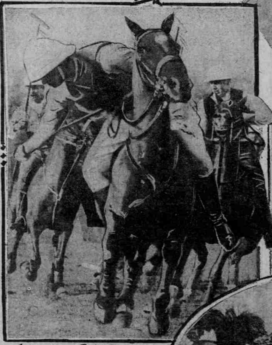
American Polo Team in Practice.