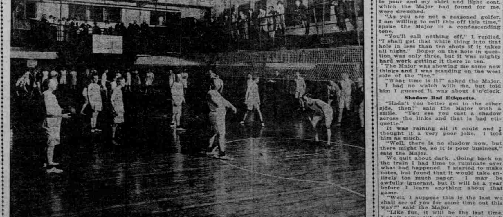
SCENE IN MAIN GYMNASIUM WHILE ROUND-ROBIN TOURNAMENT WAS IN PROGRESS THURSDAY NIGHT.