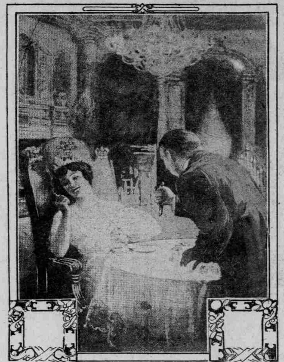
Scene from "What Will People Say" A Novel of The New York Idle Rich