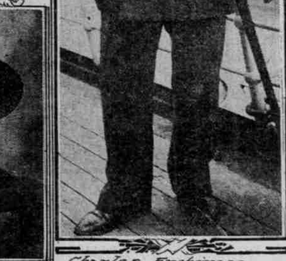
Charles Frohman, Theater Manager—Photo