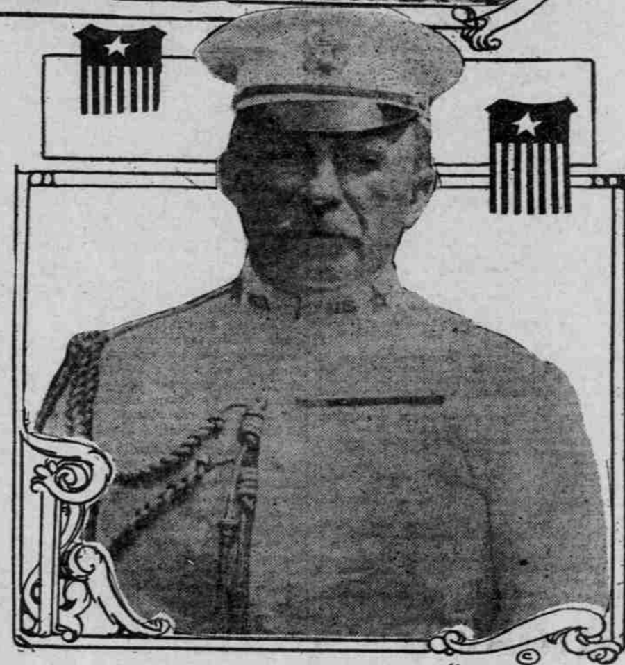
ARMY STEAMER HANCOCK PREPARING TO SAIL FROM NEW ORLEANS. BELOW—NEW PHOTOGRAPH OF GENERAL LEONARD, WHO WILL COMMAND ACTIVITIES ON BORDER.